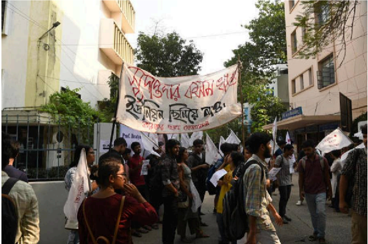
Students protest at JU on Saturday afternoon