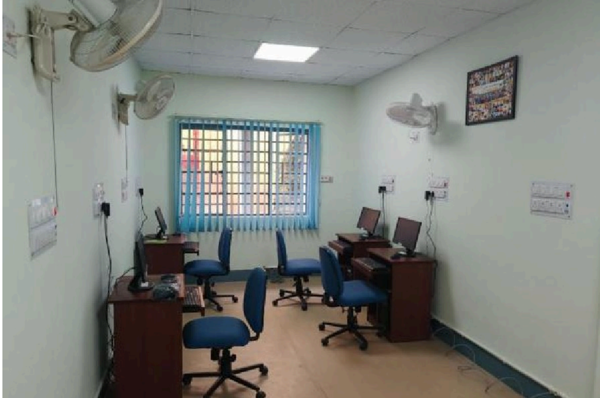
The geotech laboratory gifted by former students of the civil engineering department

Former students of Jadavpur University's two departments — civil and electrical engineering — collaborated to set up two state-of-the-art labs that the university could not afford on its own.