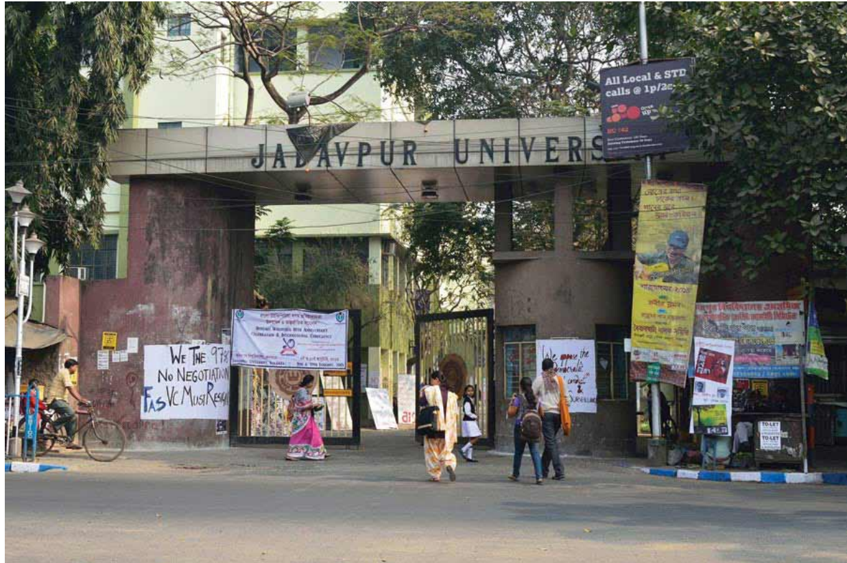
Jadavpur University File picture