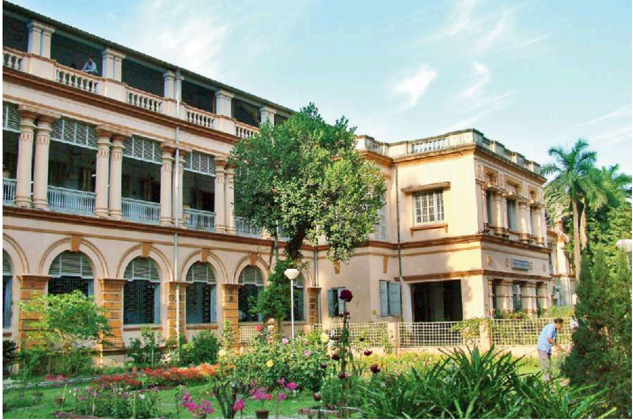
Jadavpur University File picture