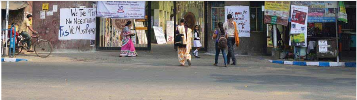
Jadavpur University File image

Jadavpur University decided on Wednesday that it will not allow students to lock the doors of the rooms allotted to teachers across departments in the name of agitation anymore.