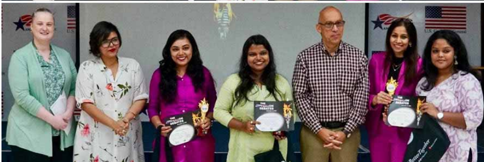
iLEAD grabbed the position of the first runners-up followed by Jadavpur University as the second