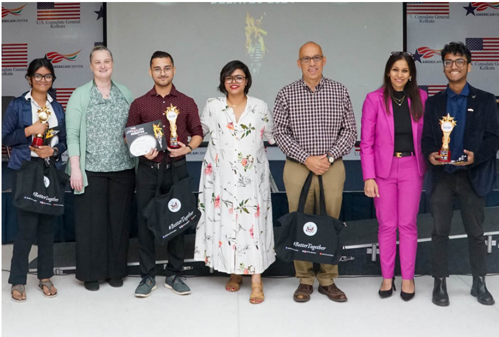
St Xavier's College emerged as the winner