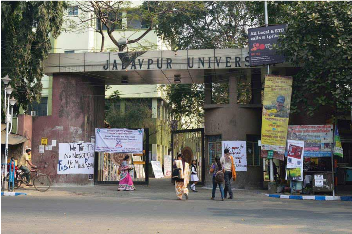
Jadavpur University File image

Jadavpur University has decided to punish students accused of conspiracy in the ragging and abetment to ragging of a first-year student who died in August last year.