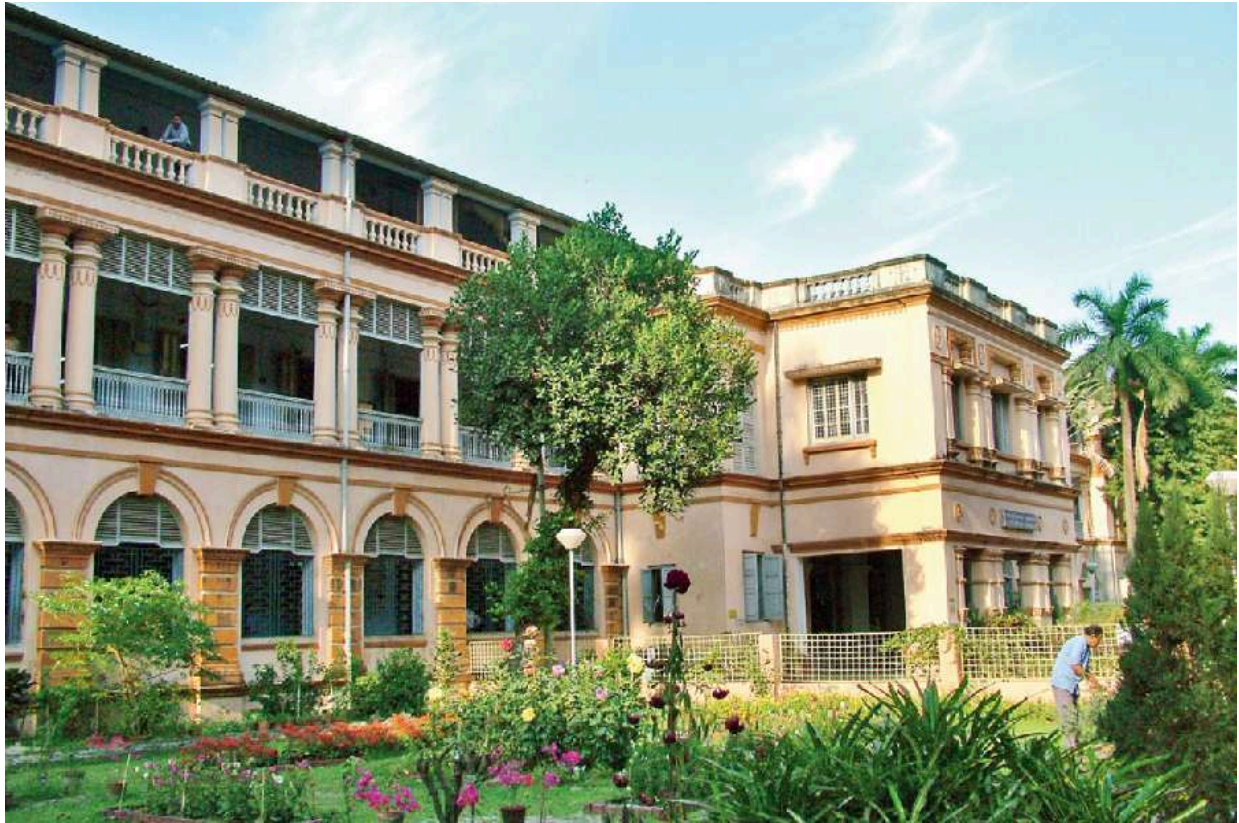
Jadavpur University

At a time when many in the city are out on the streets seeking justice for the rape and murder of the 31-year postgraduate trainee doctor at RG Kar Medical College and Hospital, a city court is hearing a case of abetment to suicide against senior students of Jadavpur University.