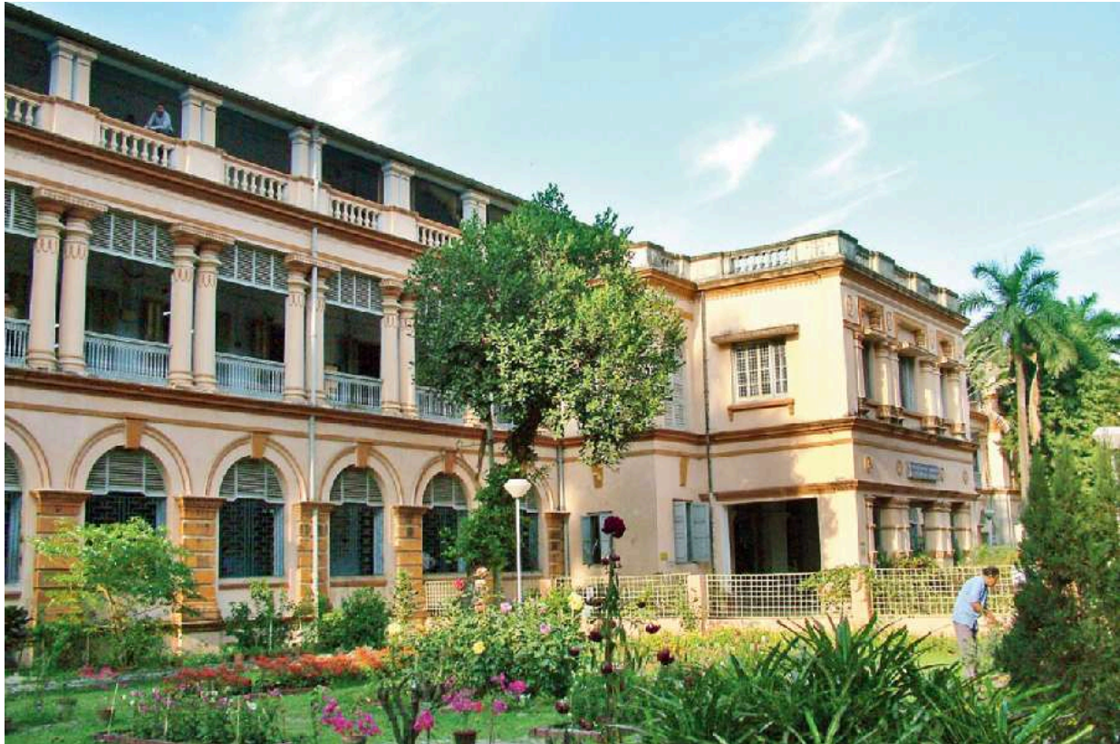
Jadavpur University File image

Jadavpur University has ranked second among state public universities and St Xavier's College 6th among colleges in India in an annual ranking exercise conducted by the Union education ministry.