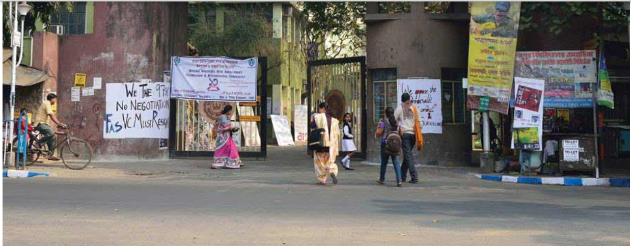
Jadavpur University File image

The state higher education department has told Jadavpur University that the students' union election has to wait till an ongoing process to amend rules governing campus polls is complete.