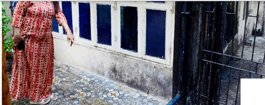
The two-year-old problem has an unknown source and no solution at hand