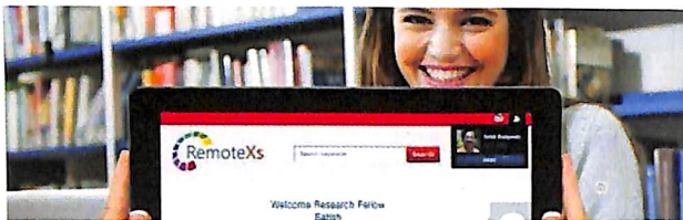
Remotexs user guide