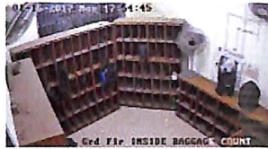
Entrance Gate & Check Counter