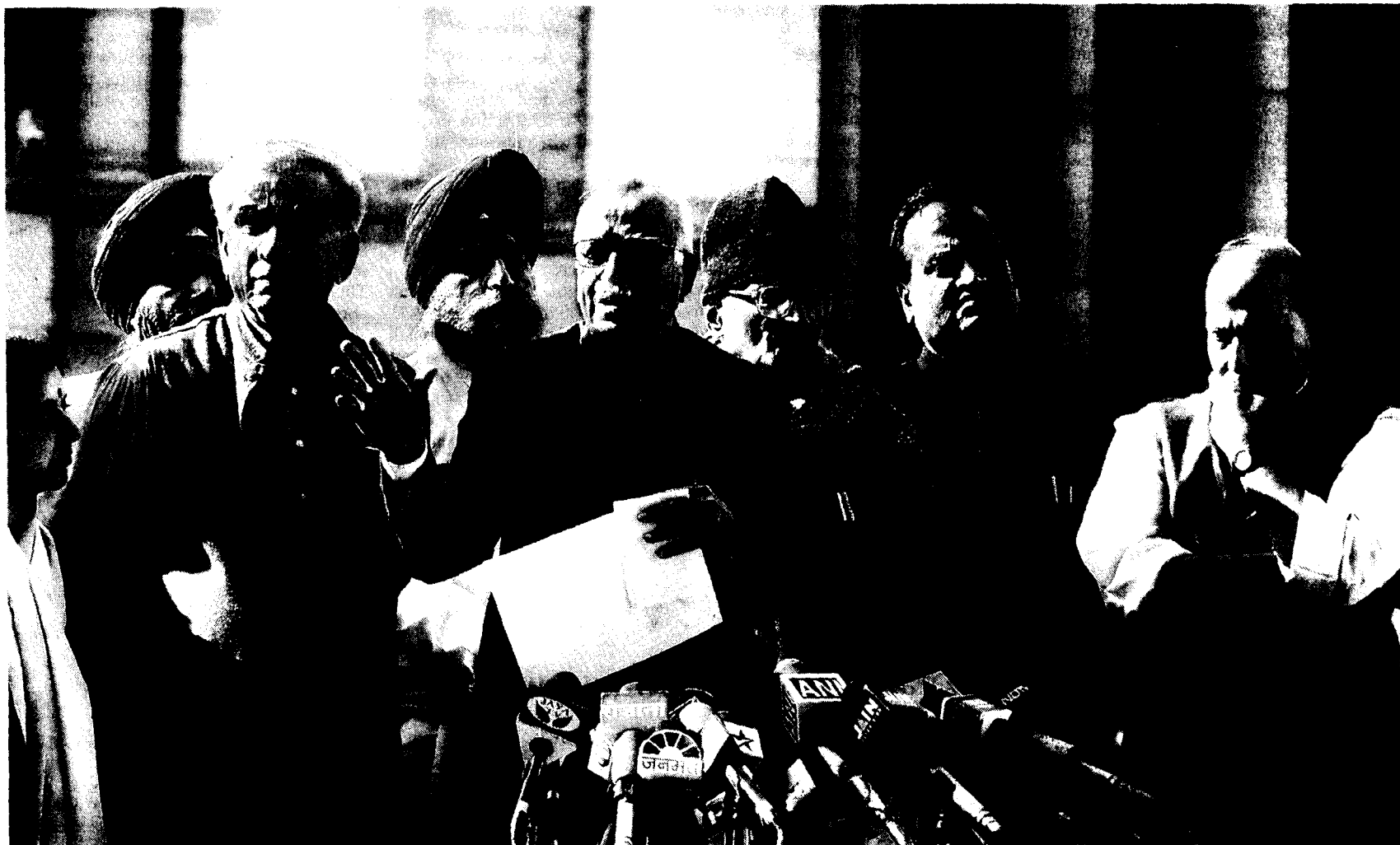
TAKING IT TO THE PRESIDENT: NDA leaders Jaswant Singh, L.K. Advani, George Fernandes, Digvijay Singh and Rajnath Singh briefing the media after submitting a memorandum to the President in connection with the Supreme Court verdict on the dissolution of Bihar Assembly, at Rashtrapati Bhavan in New Delhi on Wednesday.

Delegation meets President Kalam and submits memorandum