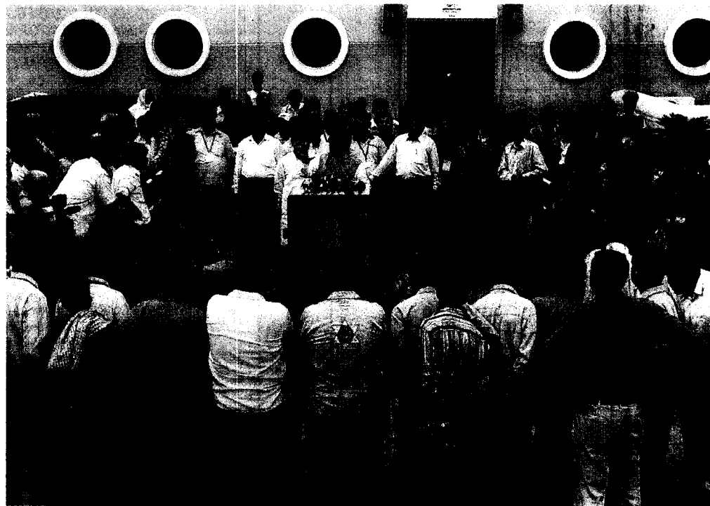
"HE WAS POISONED": BJP leader Gopinath Munde talking to the media about his nephew Rahul Mahajan at Apollo Hospital in New Delhi on Saturday.

However, within hours of Ms. Swaraj dismissing the matter, fresh controversy erupted with Mr. Munde going on record to allege that Rahul had been poisoned. Quoting the toxicology report released by Apollo Hospital, Mr. Munde held that con-