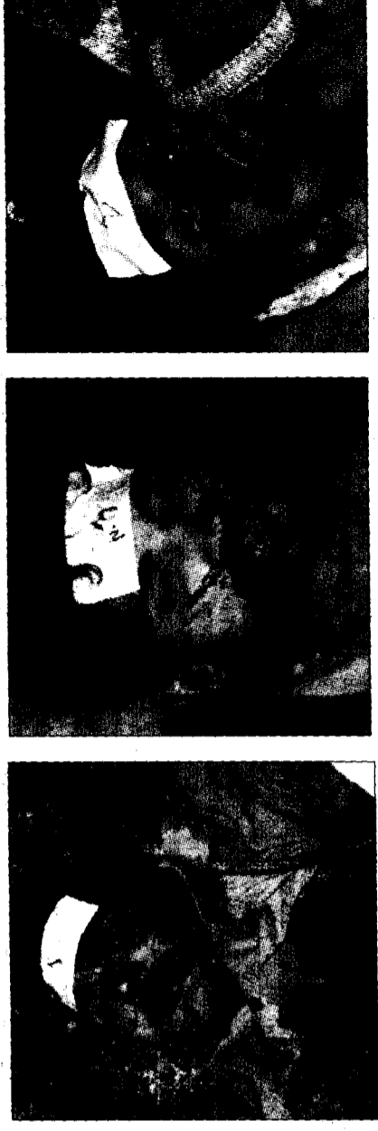
(Top) The car used by the militants in the attack and the three ultras killed in the encounter with police.