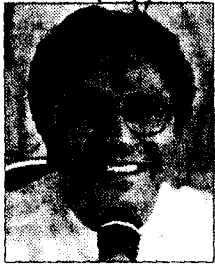
Mr Raj Thackeray

MUMBAI, March 9. — Mr Raj Thackeray today launched a new political party called Maharashtra Navanirman Sena. The flag of the party has blue, saffron and green hues symbolising a marked departure from the "mere saffron" ideology professed by him while in the Shiv Sena. The direction and policies will be spelt out on 19 March at a Shivaji Park rally, Mr Thackeray said. As he unveiled his new party's name and colours, he paid tribute to his grandfather the late Mr Keshav Sitaram Thackeray, father of Mr Bal Thackeray since his uncle had asked him not to use his