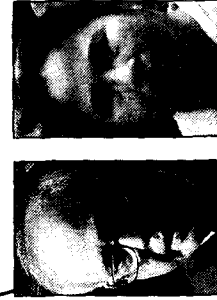
Pranab, Mamata: Firm stand

days and then announce our candidates for the remaining seats. The Congress should realise that I am not going around with a begging bowl. Our compulsion is to fight against the CPM, while Congress is to run the UPA government with CPM's support. Let the people decide which is the real