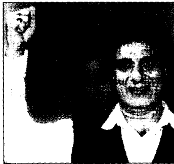
Raj Babbar after his meeting with CPM general secretary Prakash Karat in New Delhi on Tuesday

The Congress, which is at loggerheads with the SP on several issues, had on Monday come out strongly in support of Babbar for