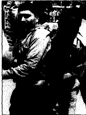
A policeman tries to prevent a pro-reservation activist from entering AIIMS where anti-quota doctors are on hunger strike.

Chidambaram was included for his ability to marshal arguments on both sides of the reservation divide and "package" the government's position "convincingly and credibly" and Shinde has been associated with the committee because he is a Dalit.