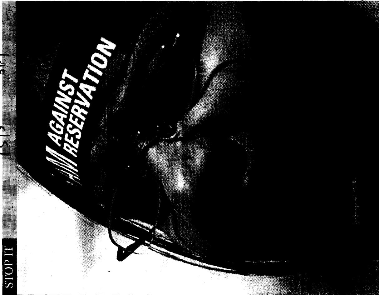
A student shouts slogans in Bangalore on Sunday. (Another photo on page 6)