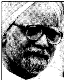
PM: Facing Flak

The report points to the ambiguity on how forest-dwelling communities who aren't tribals will be treated and insists forest managers should have a say in sustainable "exploitation" of forests — in consultation with locals.