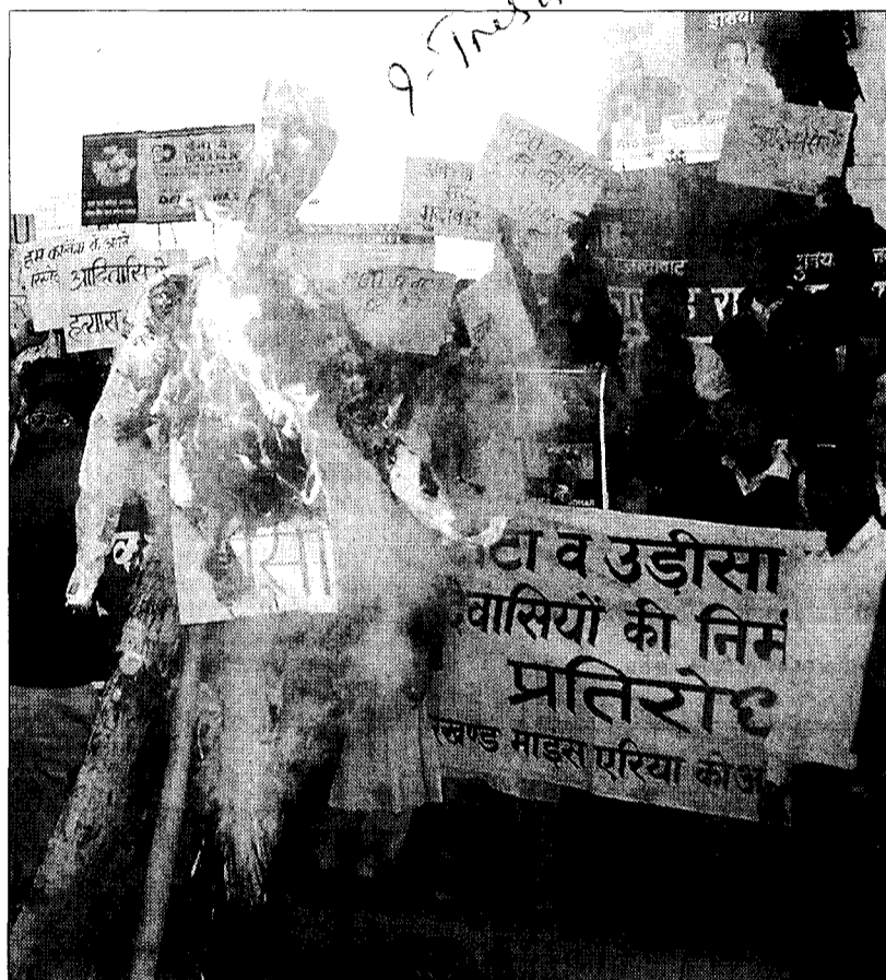
Tribals in Jharkhand burn effigy of Orissa chief minister Naveen Patnaik in protest against police firing in Kalinga Nagar.

The students in Orissa on Wednesday took to the streets in support of the families of Kalinga Nagar affected by the incident and warned the state government of a serious student unrest if the demands of tribals were not met soon. Road blockades were staged by college students in different parts of Bhubaneswar and in certain areas of