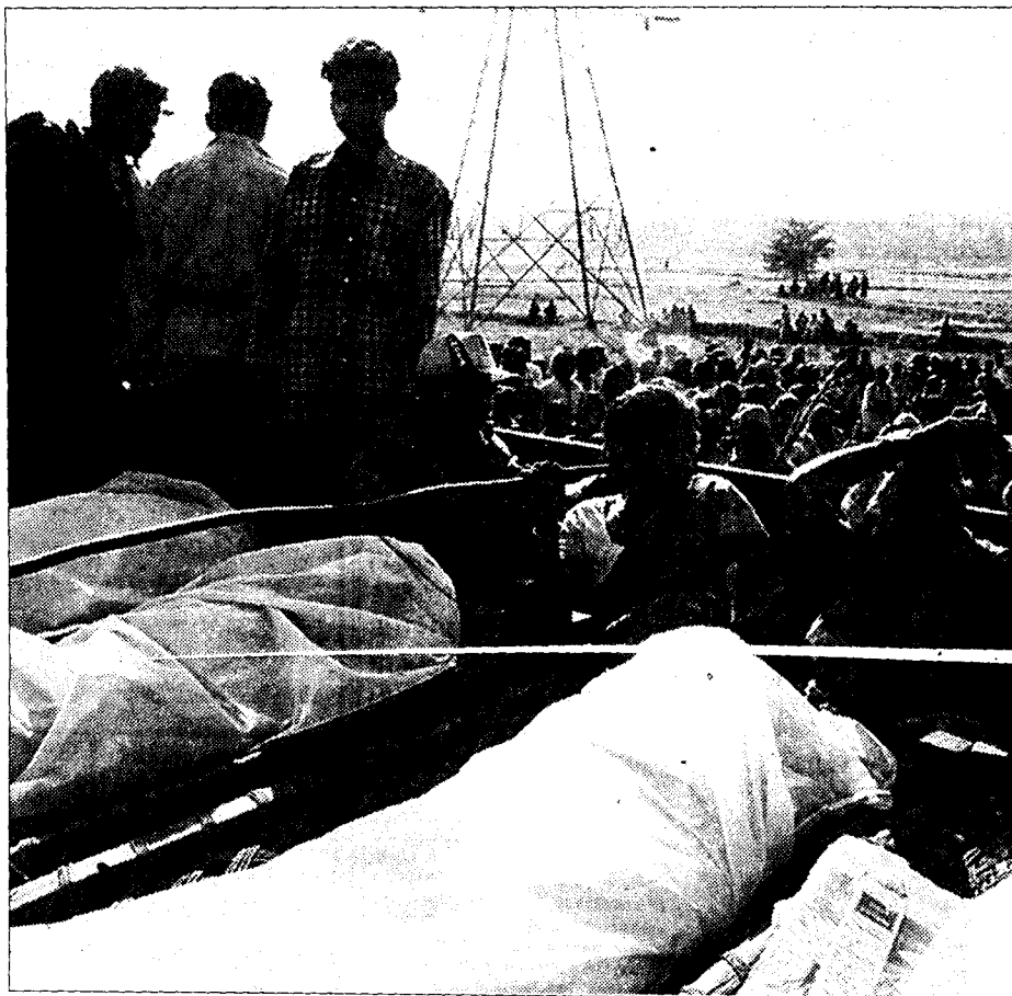
Grieving relatives of tribals who were killed in Monday's police firing at Kalinga Nagar in Jajpur district taking the bodies for post mortem.

The state government's high-level official team, meanwhile, trod cautiously today. The team remained closetted at the Kalinga Nagar police station — no member visited the site of the firing or the agitating tribals. Instead, they sought out tribal leader Padmashri Tulasi Munda to relay the government's message for them to the protesters. Assuring