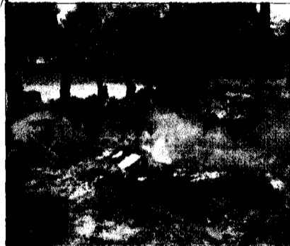
The debris of a fire-ravaged house in Hemariterang village of Karbi Anglong district on Monday.

Mr Pathak said that additional Battalions of Assam police and paramilitary forces had been deployed in different parts of the district because of escalation of the violence. The district Superintendent of Police was personally supervising a large-scale combing operation to ferret out the anar-