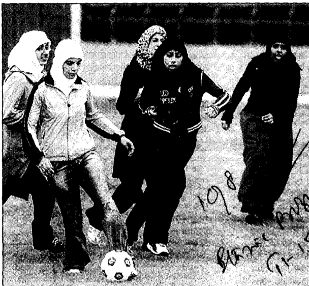
BEND IT LIKE BLEARS

Minorities Up Against America-Like 'Re-Branding'