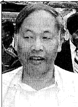
Okram Ibobi Singh

The students' body, which claims to represent the hill dwellers, said the tribals have already been hit hard by the imposition of Manipuri language on them right from the primary level to the civil services Manipur is divided