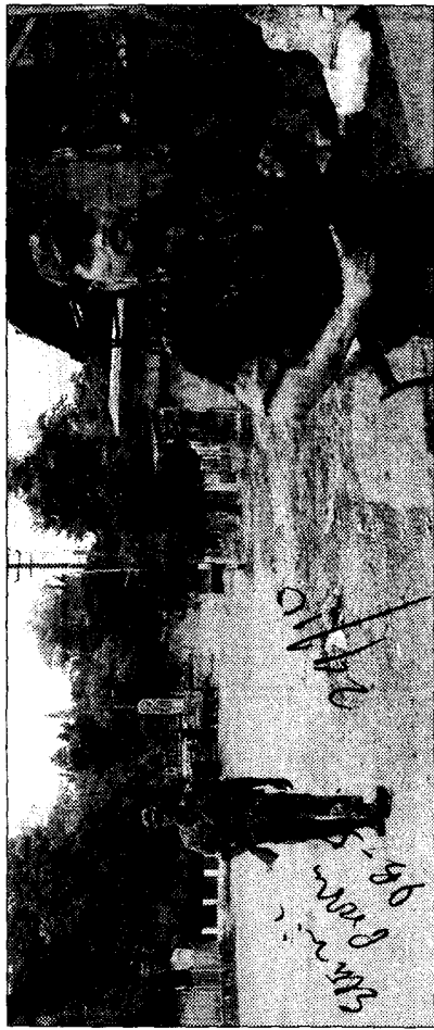
Army jawans patrol the streets of Diphu town in Karbi Anglong district of Assam. P71

The number of relief camps in the district has risen to 53, while 10 camps have been