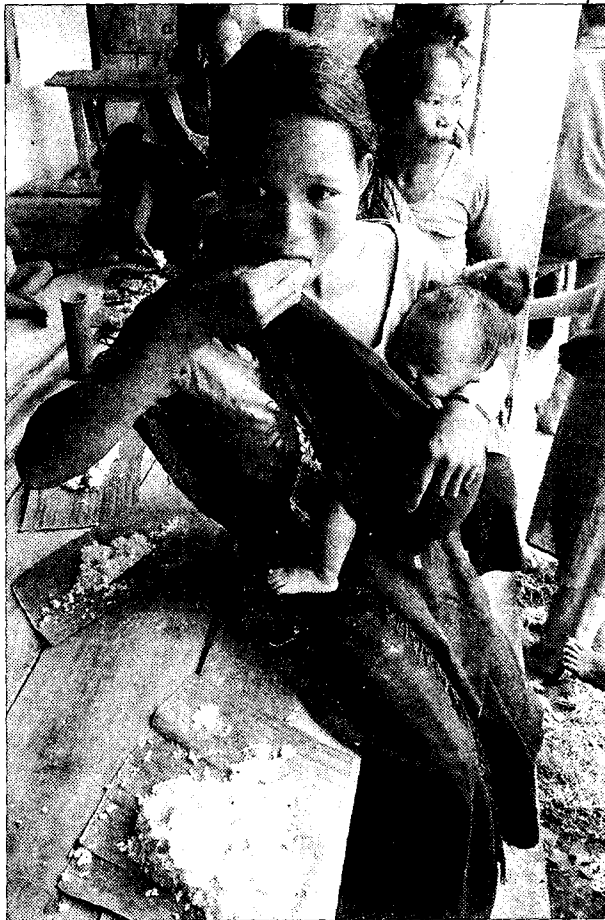
Karbi tribal women take their lunch at a relief camp at Kheroni police station in Karbi Anglong district, Assam.