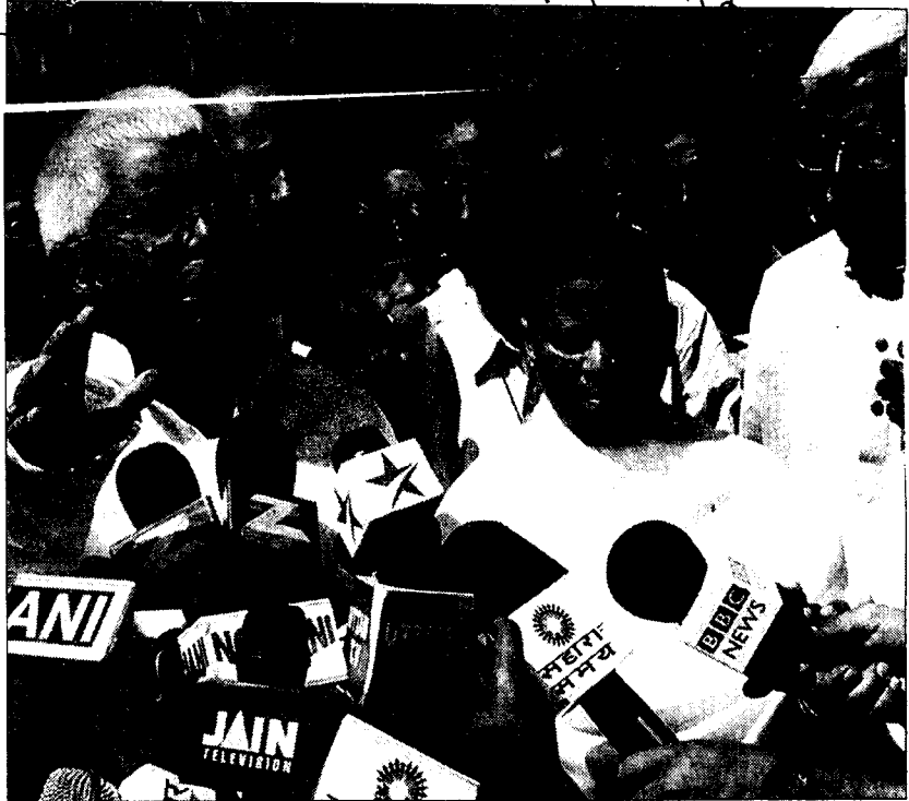
Mr Lalu Prasad and his wife, Mrs Rabri Devi, address the media in Patna after the chief minister tendered her resignation to the Governor on Monday.

While Mr Paswan has been advocating a minority candidate for the chief minister's post, he categorically declared that he would neither support the RJD nor the BJP. The LJP president's stand leaves room for the return of a "secular" government in the state. Mr Prasad's curious silence on the chief ministerial candidate has added grist to the rumour mill. "Our party will decide who will be the chief minister" was