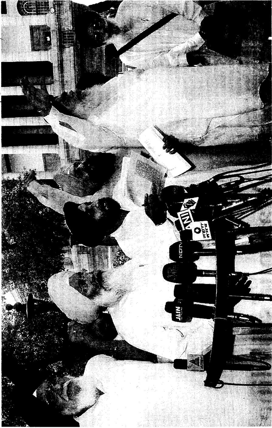
VOCIFEROUS PROTESTS: Akali Dal MPs raising slogans outside Parliament House soon after the Nanavati Commission report was tabled in Parliament.

The Akali leader said the Nanavati report had enough evidence against senior Congress leaders such as Jagdish Tytler, Sajjan Kumar and Dharam Das Shastri. The Commission's report and the Government's ATR had rubbed salt in the gaping wounds of the Sikhs, Mr. Badal said.