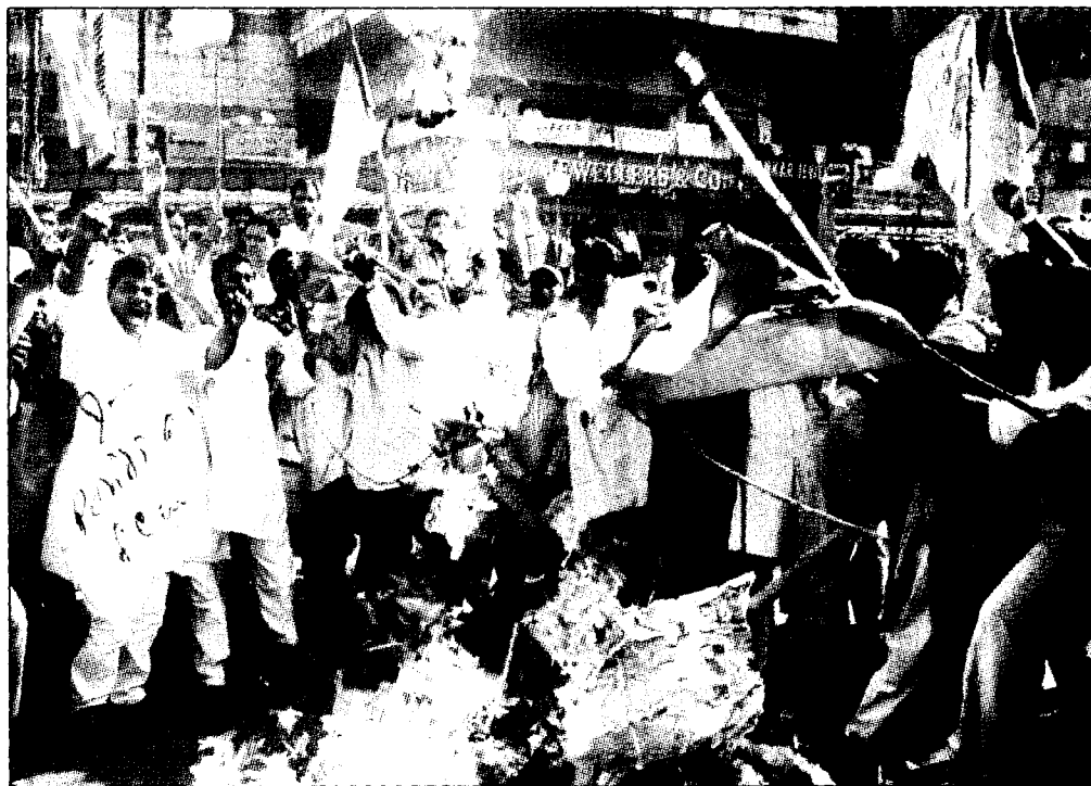
Activists of NDA burn the effigies of Prime Minister Manmohan Singh, RJD president Lalu Prasad and Bihar governor Buta Singh during a demonstration to protest against the dissolution of Bihar assembly in Patna on Monday

In the elections held to the 243-member state assembly earlier this year, no party or alliance had obtained a clear majority. The state was, therefore, brought under