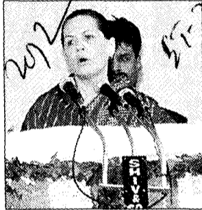
TALK TIME: Congress president Sonia Gandhi addressing an election rally at Gandhi Maidan in Patna on Saturday.

"But the people of the country skuttled their attempts by voting them out of power in the Lok Sabha while giving the UPA a chance to work for them," she said and alleged the BJP-led NDA in Jharkhand had also followed the same sort of politics. "The UPA will take all sections of the society while im-