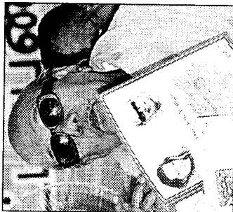
KARUNANIDHI: TOUGH STAND

Another DMK nominee, T.R. Baalu, made it known to the plan panel deputy chairman Montek Singh Ahluwalia that the infrastructure panel led by him may not get to direct the affairs of the surface transport department. The strains in the coalition will not suit the Centre before a crucial Parliament session.