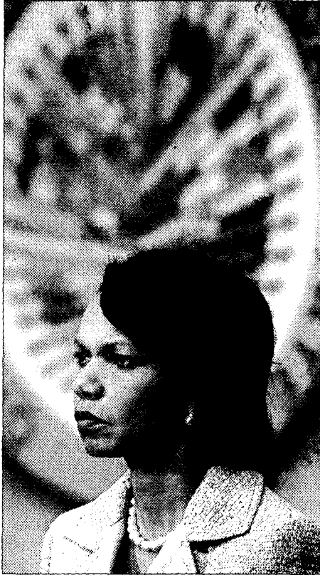
Ms Condoleezza Rice

“So again, it is awfully important in these great historical sweeps to step back and look at where you were and where you’ve come....” On whether democratic India had a better chance for economic success than communist China, Rice said “I think the kind of creativity that is demanded of people and the freedom to let people do what they do best really does only come in free societies.” “I don’t for a moment underestimate or