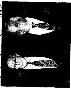
Donald Rumsfeld with Pak defence minister Rao Sikander Iqbal in Rawalpindi

package assured by US President George W. Bush as a reward for