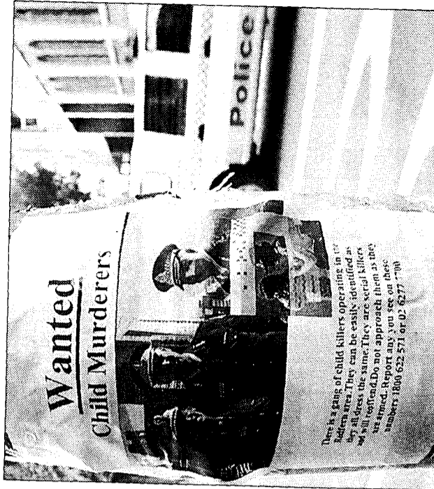
A police car drives past a poster taped to a pole which accuses the police of murder in the Sydney suburb of Redfern.

"Last night's display of violence is an extreme example of the extent of the alienation felt by some Aboriginal kids and the manifestation of the difficult relationships in the area."