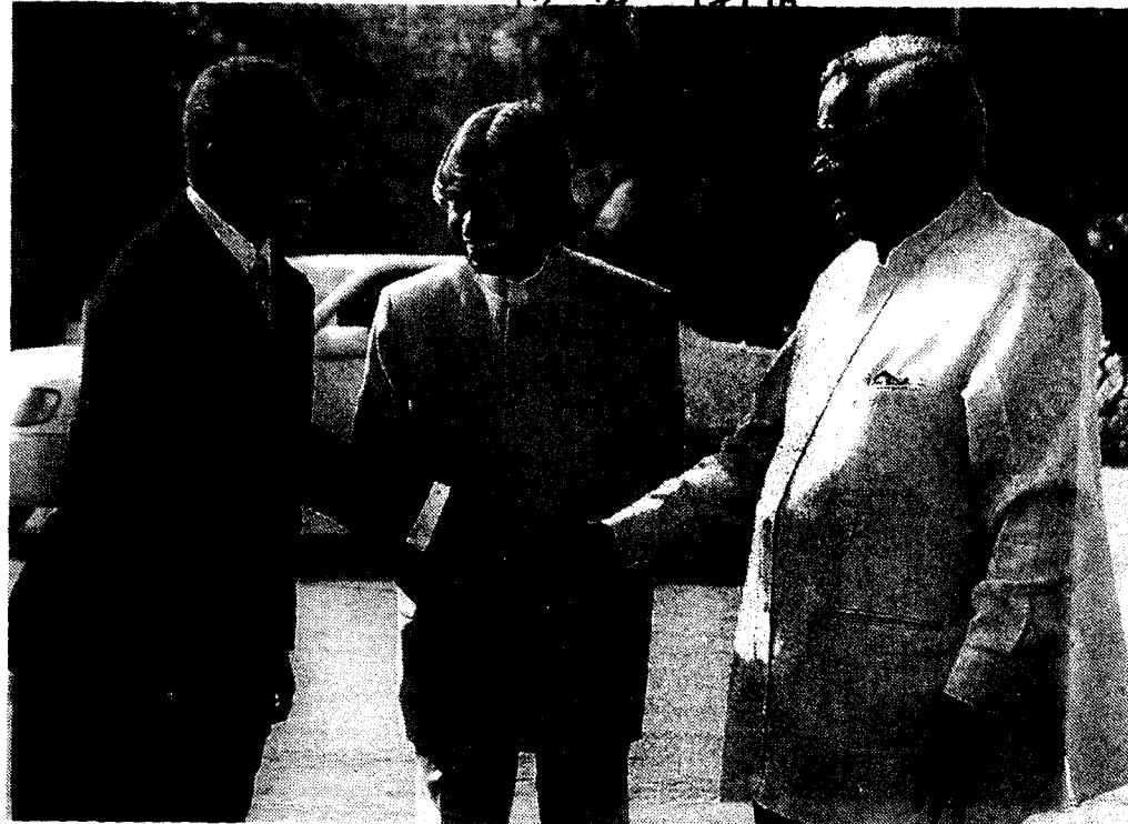
The President, A.P.J. Abdul Kalam, with the Prime Minister, Atal Bihari Vajpayee, welcoming the President of the Republic of South Africa, Thabo Mbeki, at the Rashtrapati Bhavan in New Delhi on Thursday.

In his only public engagement, Mr. Mbeki said a "strong" India-South Africa relationship