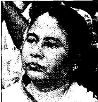
Mamata Banerjee The crusade is on