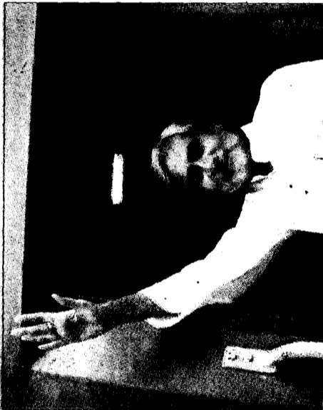
RIGHT OF WAY? Mr Nitish Kumar after laying the foundation of the East-Central Railway headquarters at Hajipur.

with the Janata Dal (U) against the wishes of the railway minister. But the JD-U split with four of