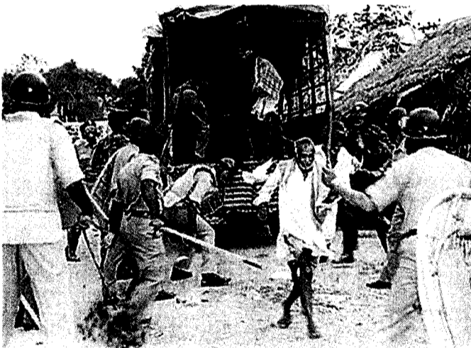
Police caning farmers to prevent them from reaching the Kabini reservoir in Mysore on Sunday.