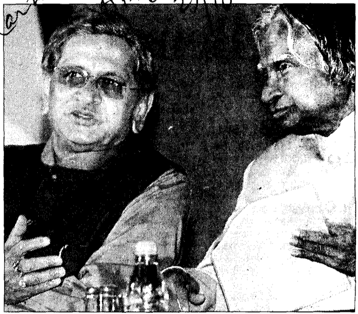
Chief Minister SM Krishna speaks to President Abdul Kalam during the inauguration of the IT fair in Bangalore on Monday.

Though the Supreme Court has given Krishna a reprieve, the State Government is now left