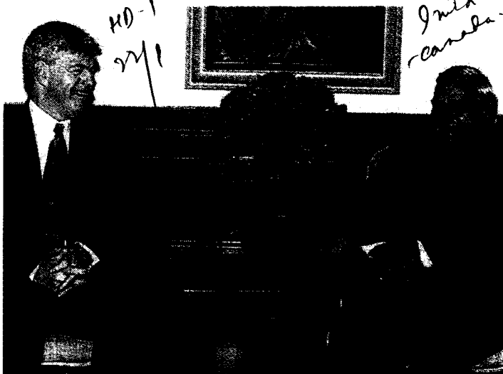
The Canadian Deputy Prime Minister, John Manley, with the Prime Minister, Atal Behari Vajpayee, in New Delhi on Monday.

Mr. Manley, who had met the Pakistan President, Pervez Musharraf, prior to his arrival here said that he had discussed with him India's list. Gen. Musharraf had pointed to the need for evidence from the Indian side to enable him to take action, but had reiterated that no Pakistani national on the list would be returned. "There was no flat refusal... so,