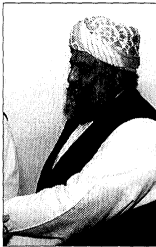
Maulana Fazlur Rehman at a meeting in Islamabad.