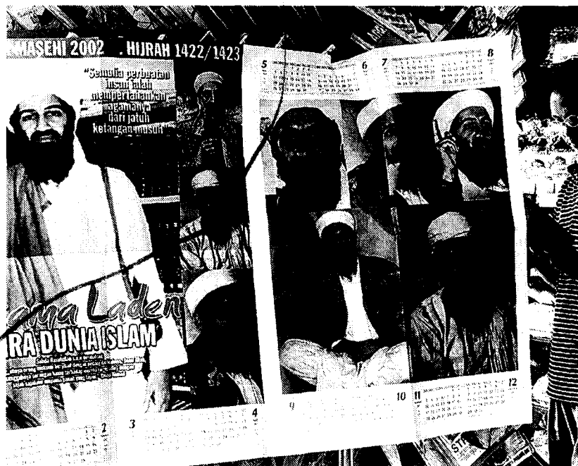
A hero beyond his turf?

Clearly, there appears to be a larger Islamist militant plan for South-East Asia. Militants in Singapore, Malaysia and Indonesia are reported to have close links — a cause for concern given that the