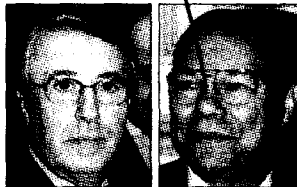
M. Ben Aissa Colin Powell

Morocco: Soldiers who raised their country's flag over a tiny island in the Strait of Gibraltar last weekend, only to be expelled a few days later by the Spanish special forces, were woefully ill-prepared for a lengthy occupation. For one thing, it did not occur to them to bring food and water.