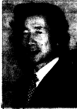
Mr Junichiro Koizumi

The contingency-related bills initially were expected to pass through the Diet with few problems, but circumstances have changed since the Diet session began. Factors contributing to such changes include a scandal over the Defence Agency retaining personal data on individuals