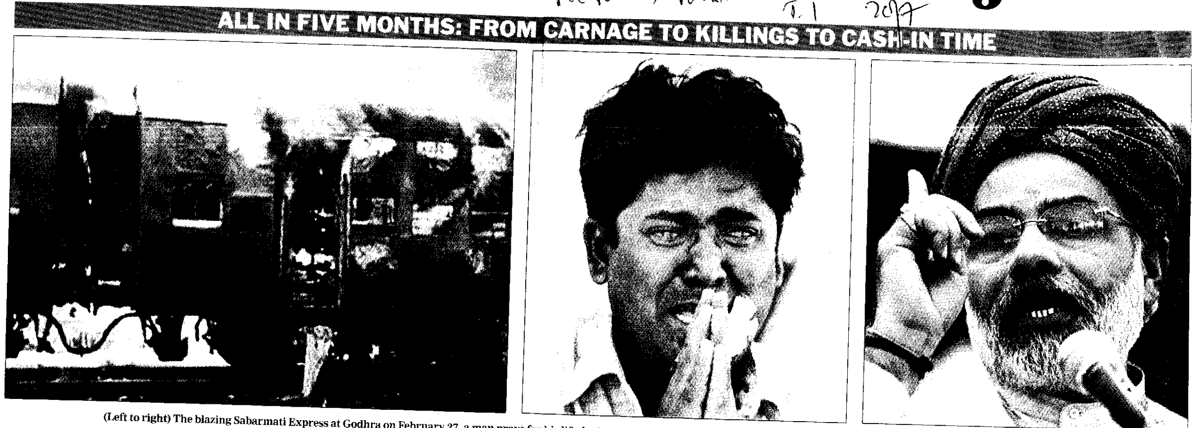
(Left to right) The blazing Sabarmati Express at Godhra on February 27, a man prays for his life during the Ahmedabad riots and chief minister Narendra Modi at a recent rally.

Justifying his decision, Modi said since he took over as chief