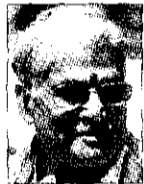
M.M. Joshi politically motivated, mischievous or made out of ignorance"

The court explained that studying religions was "necessary under the prevailing circumstances in the country and for its unity and integrity". Referring to the increase in communalisation in the country, the bench said, "The post-Partition era has been vitiated by communal violence, impeding the growth of the nation. And it is of prime importance to educate children in such a manner that they understand about all religions."