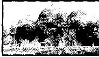
A file photo of the Babri masjid.

At their meeting with the PM on Sunday, VHP leaders had asked that legal opinion be secured before March 12 since they planned to begin construction of the temple thereafter. Mr Vajpayee refused to give any assurance and reportedly added that even if it was legally possible, the land would not be handed over unless the BJP's NDA partners as well as the opposition agreed.