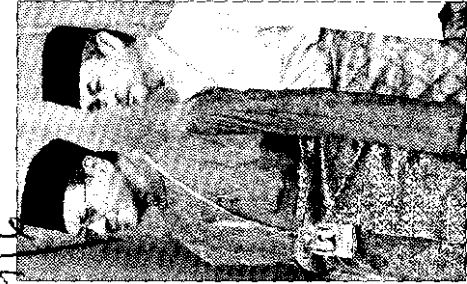
Deputy PM Abdullah Ahmad Badawi with PM Mahathir Mohamad

"But when Dr M Dropped the bombshell, many who hated him now supported him. We hope this transition period will bring good to the nation," it said.