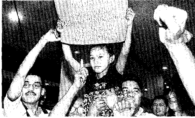
Malaysians carry a placard and chant slogans at the United Malays National Organisation headquarters in Kuala Lumpur on Saturday.

KUALA LUMPUR, JUNE 22. The Malaysian Prime Minister, Mahathir Mohamad, shocked his country on Saturday by announcing he was stepping down from leading his party and governing coalition, but reversed himself and withdrew the resignations after weeping supporters begged him to stay. The political theatre, played out in a televised broadcast, whipsawed the emotions of the nation and of the 2,000 delegates to the annual party congress of the ruling United Malays National Organisation. The Islamic fundamentalist opposition, Dr. Mahathir's target in elections that loyalists are urging him to call early next year, dismissed the moves as political grandstanding. Dr. Mahathir said he was step-