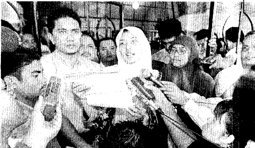
Nurul Izzah, daughter of Malaysia's former Deputy Prime Minister, Anwar Ibrahim, reads a statement at the courthouse where her father was appearing in Kuala Lumpur on Wednesday.

"The judiciary has been emasculated and bludgeoned into submission at the hands of Dr. Mahathir," Mr. Anwar said. "I wish Dr. Mahathir good luck. He has nothing left to destroy." There was no immediate comment from Mahathir. Rais Yatim, Malaysia's de facto Law Minister, denied that the judges had succumbed to political pressure. "These are baseless accusations," Mr. Rais said. "Everyone should abide by the ruling of the highest court in the land. It is as simple as that." However, the ruling produced an uproar from opposition leaders and Mr. Anwar's family, who alleged that the Federal Court had done Mr. Mahathir's bidding, an accusation government officials denied.