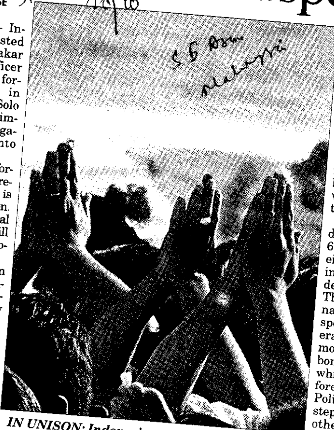
IN UNISON: Indonesians join hands in prayer at a memorial service for the Bali blast victims at Kuta beach on Saturday.