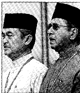
Mahathir Mohamad (right) with deputy Abdullah Ahmad Badawi in Kuala Lumpur.

Abdullah said Mahathir's position was in no way diminished and he would keep the finance ministry portfolio for the rest of