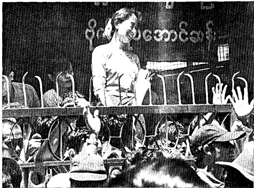
SHEER TENACITY: Aung San Suu Kyi talking to supporters at opposition party headquarters following her release from house arrest in Yangon. When she tells the people the road to freedom is long, she also needs to understand that splinters of glass are dangerous for cupped hands too