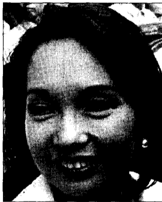
Mrs Arroyo: Healing touch

In her closing statement during the live telecast of "May Gloria sa Bukas Mo," President Arroyo said she