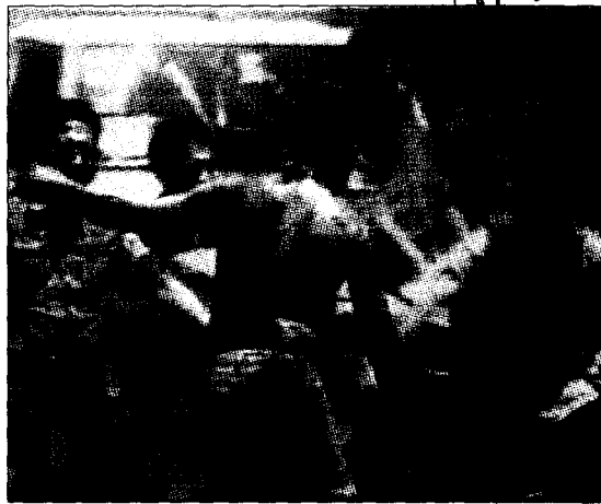
A policeman rushes to assist a man injured in one of the two bomb blasts in Zamboanga on Thursday.

The military has tagged a leader of the Abu Sayyaf Muslim kidnapping group as being behind the bomb attacks. A military spokesman said the bombs used in Thursday's attack in Zamboanga city were the same type used in an October 2 bombing that killed a US serviceman and three Filipinos here. Agencies