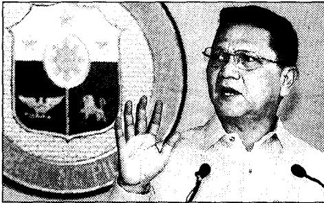
Defence secretary Angelo Reyes gestures during a news conference at the defence headquarters in suburban Quezon City, Philippines, on Monday.

Currently the Abu Sayyaf hold two American missionaries who were kidnapped in a daring raid on a beach resort on the western island of Palawan last May, as well as one Filipina nurse. A third American was taken at that time and subsequently beheaded. It is thought the three hostages are being held somewhere on Basilan.