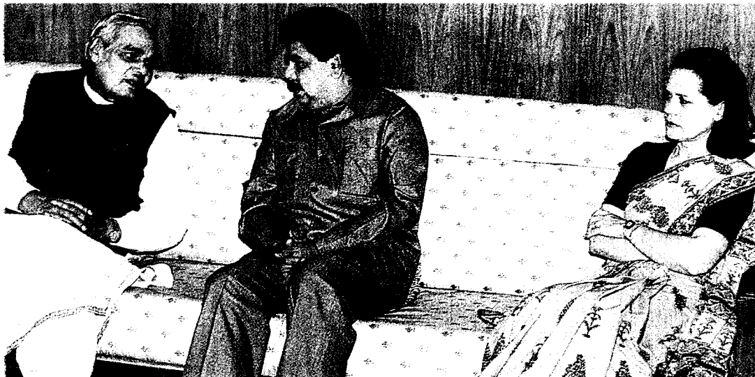
The Prime Minister, Mr. Atal Behari Vajpayee, with the Lok Sabha Speaker, Mr. G. M. C. Balayogi, and the Leader of the Opposition, Ms. Sonia Gandhi, in the Speaker's chambers in Parliament House on Monday.

Government has secured a concession from the Opposition that the financial business must be allowed to be discussed and debated, while the Government has conceded the feasibility of the idea of a JPC probe. The "pact" conforms to the classic parliamentary dictum that "the Government must have its way and the Opposition should have its say".