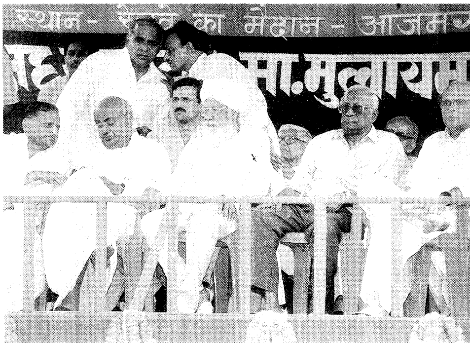
The third front leaders, Mr. Mulayam Singh Yadav, Mr. H.D. Deve Gowda, Mr. Harkishan Singh Surjeet, Mr. A.B. Bardhan and Mr. V.P. Singh at the first-ever rally since the front was formed, in Azamgarh on Tuesday.

Dravida Munnetra Kazhagam, at one end of the spectrum, and the Shiv Sena at the other which kept away from the NDA rallies, Mr. Deve Gowda hinted at a possible realignment after the May 10 Assembly elections.