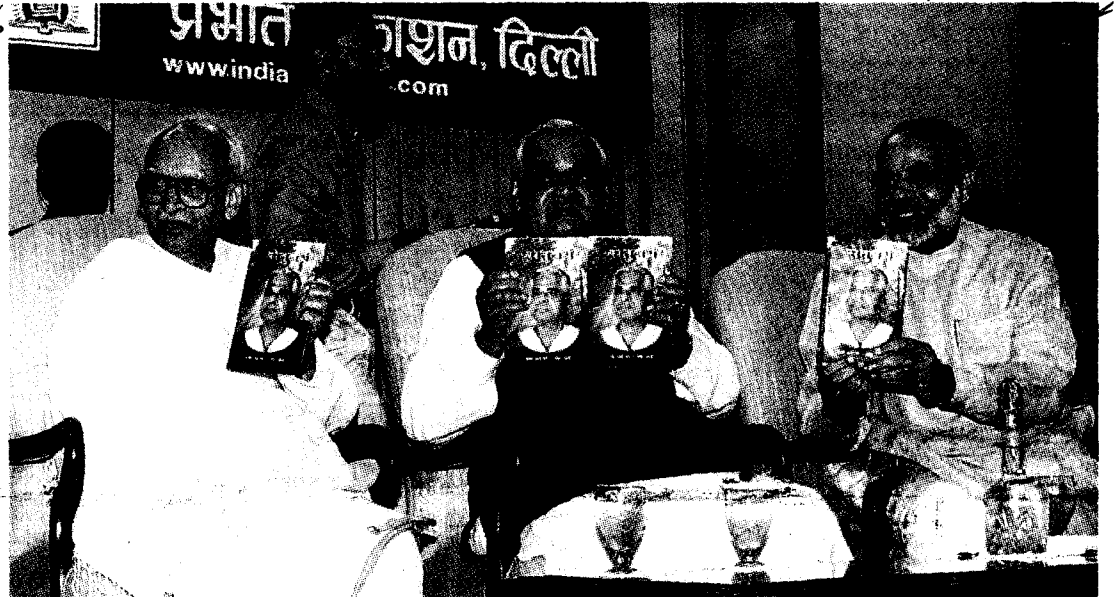
The Prime Minister, Mr. Atal Behari Vajpayee, releasing the book, Sethubandh, at his residence in New Delhi on Saturday. On his left is the RSS chief, Mr. Sudarshan, and to his right, Mr. Narendra Modi, BJP general secretary and one of the authors of the book.

Mr. Vajpayee also endeared himself thoroughly to the RSS crowd by lamenting that the media in general was unappreciative of the activities and sacri-