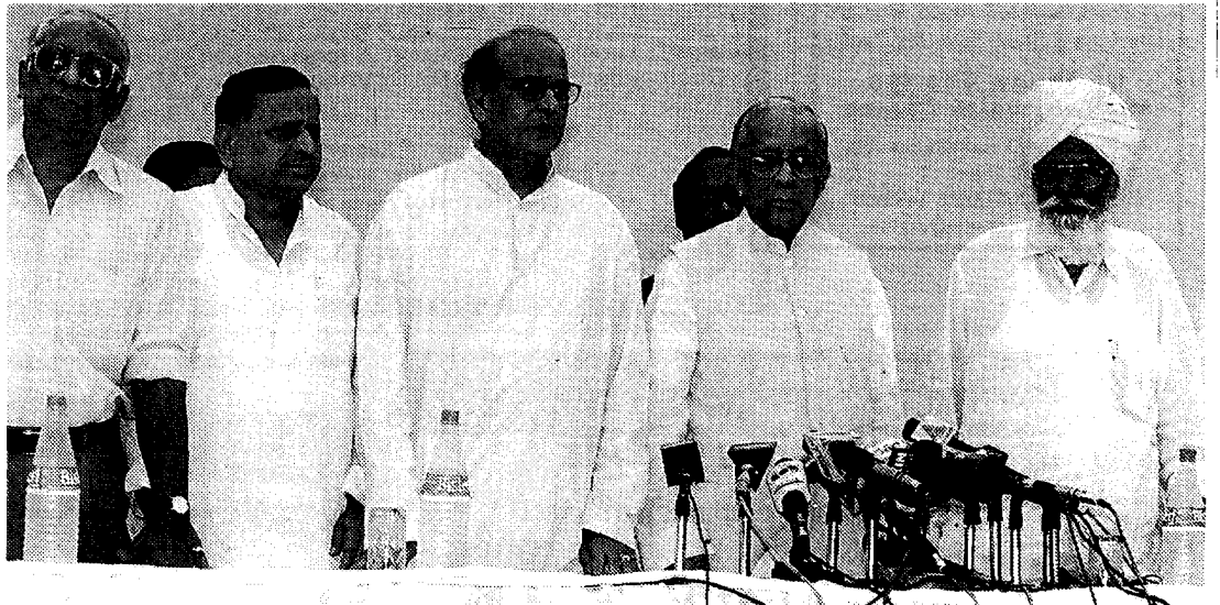
The leaders of the People's Front, Mr. A.B. Bardhan, Mr. Mulayam Singh Yadav, Mr. V.P. Singh, Mr. Jyoti Basu and Mr. Harkishan Singh Surjeet, at a press conference in New Delhi on Saturday.