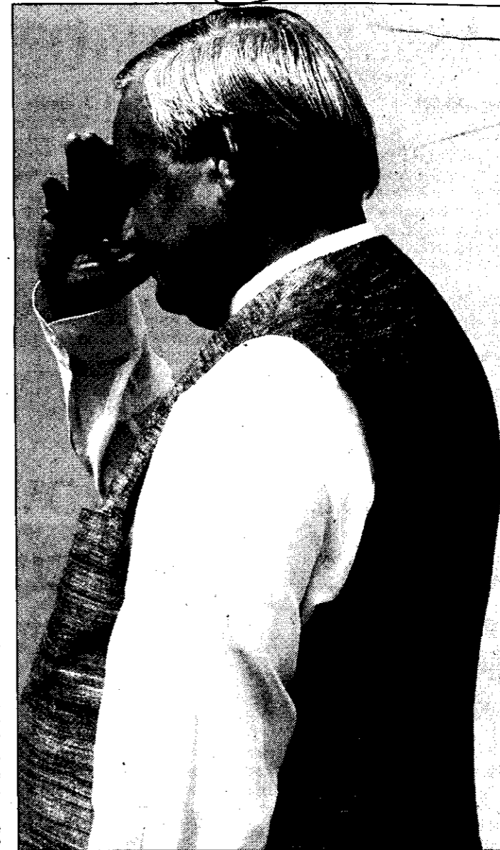
Prime Minister Atal Behari Vajpayee has challenged the Opposition to bring down the government if they have the numbers.

The Rashtriya Lok Dal (two members) of Ajit Singh is slated to join the government as the BJP needs Mr Singh for the Uttar Pradesh elections as well. So is it a near