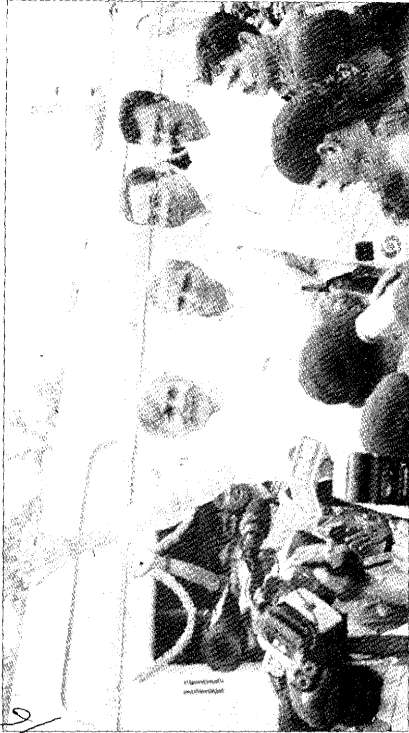
Railway Minister Nitish Kumar at the inauguration of the Duan station on Thursday.