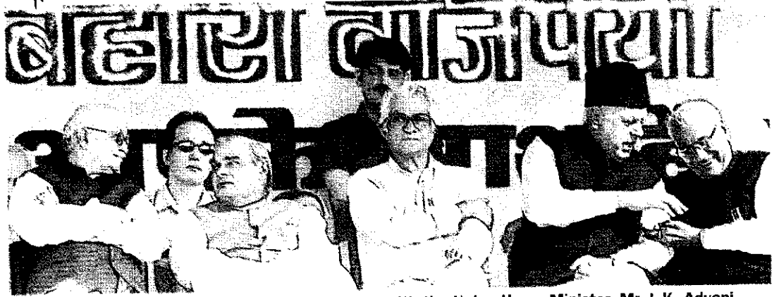
The Prime Minister, Mr. Atal Behari Vajpayee, with the Union Home Minister, Mr. L.K. Advani, the former Defence Minister, Mr. George Fernandes, the Jammu and Kashmir Chief Minister, Dr. Farooq Abdullah, and his Haryana counterpart, Mr. O.P. Chautala, at the NDA 'Virat rally' in New Delhi on Sunday.

the Congress and assailed its obstructionist tactics in Parliament and provocative attitude outside. Rare was a speaker who referred to the 'Third Front', with most of the leading lights invited to speak focussing their belligerence on the Congress and its chief, Ms. Sonia Gandhi.