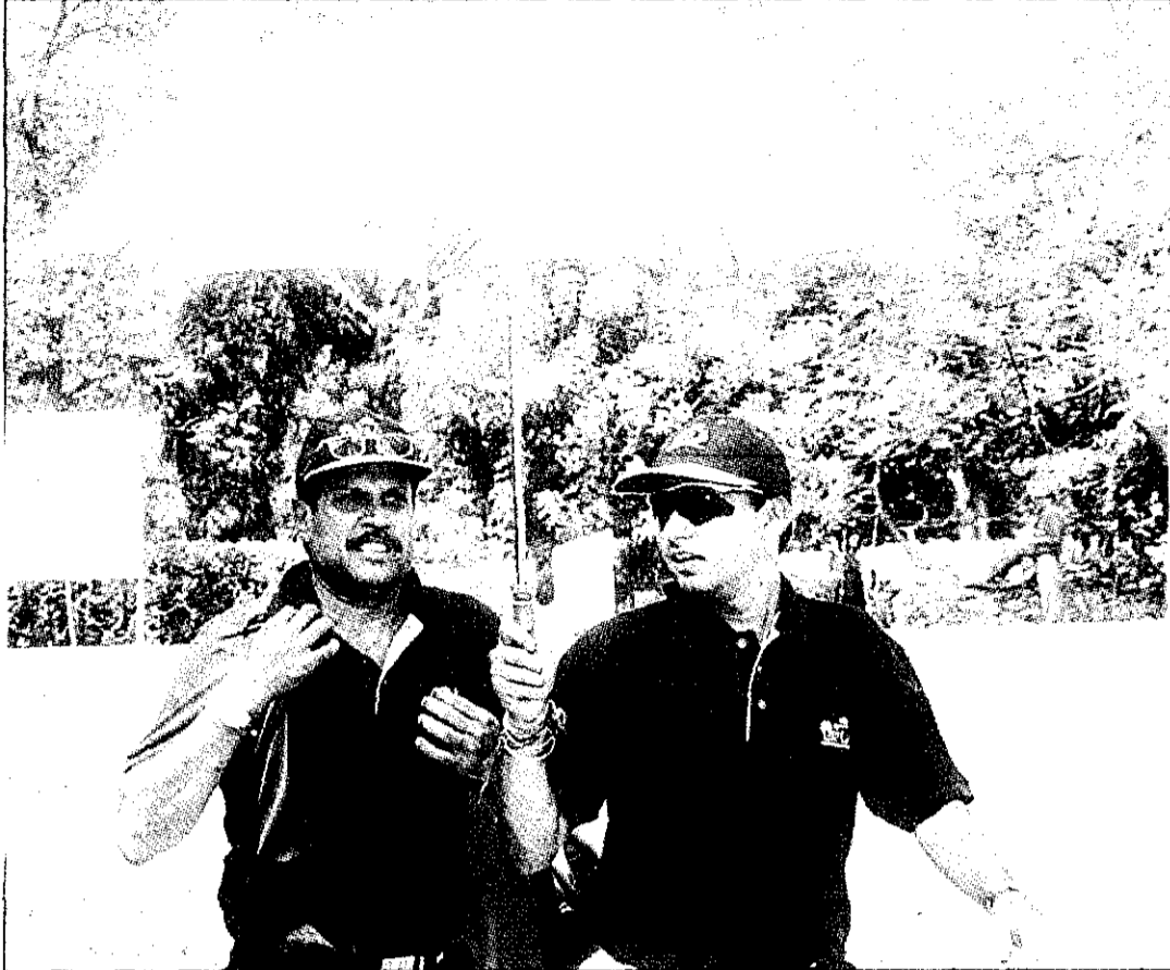
Banned cricket hero Ajay Jadeja, with his mentor Kapil Dev in tow, spends one of his last days of bachelorhood on the golf links of the Willingdon Sports Club during the Mayfair tournament in Mumbai on Sunday. Jadeja is to wed the daughter of Samata Party leader Jaya Jaitly on March 30 in Delhi.