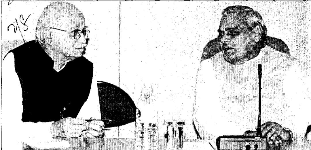
PLOTTING STRATEGIES: Prime Minister A.B. Vajpayee and home minister L.K. Advani at the NDA meeting in New Delhi on Wednesday.

Prime Minister, who looked tense on Tuesday, was a changed man after the NDA meeting. He disarmed the Opposition which wanted to have some mirth at his expense by acknowledging that he had indeed offered to resign. "Monsoon is on. Clouds will, of course, be there. But they do disappear," said Mr Vajpayee, implying that the crisis being talked about had already blown over.