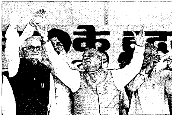
Prime Minister A.B. Vajpayee, home minister L.K. Advani and NDA convener George Fernandes wave to the crowd at the NDA rally in New Delhi on Sunday.

NEW DELHI: The National Democratic Alliance (NDA) on Sunday accepted the gauntlet thrown by the Congress in the wake of the Tehelka expose pertaining to defence deals, declaring to carry the fight to the length and breadth of the country. "It's a challenge we have accepted. They have called it a war," said Prime Minister Atal Behari Vajpayee, referring to Congress president Sonia Gandhi's declaration of war against the NDA government at the AICC plenary session in Bangalore. Addressing a mammoth gathering of NDA supporters who had come from all parts of the country at the historic Ramlika Grounds here, Mr Vajpayee said, "They (Congress)