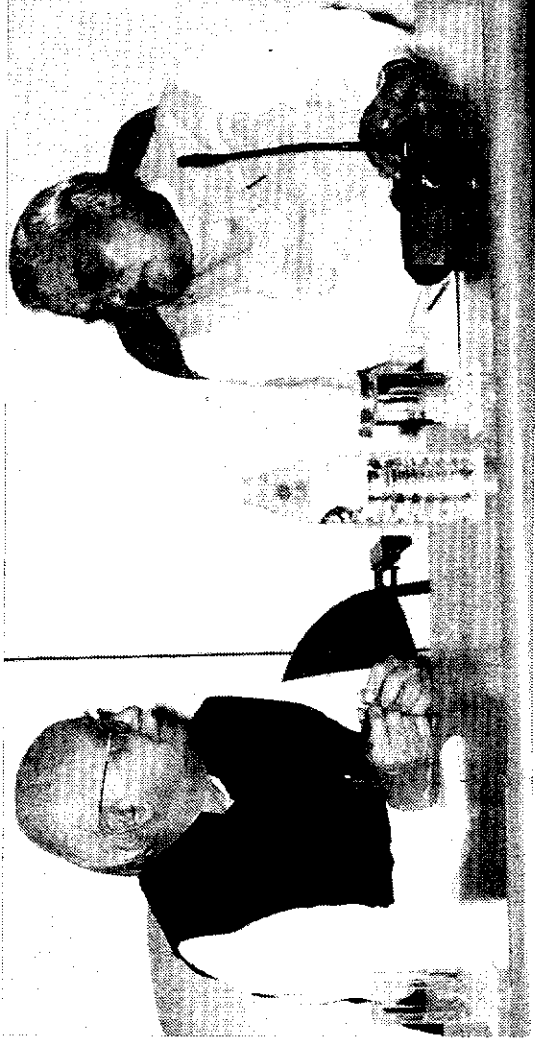
Mr Atal Behari Vajpayee and Mr LK Advani at the NDA meeting in New Delhi on Wednesday.

The tone of the meeting was set by the J&K chief minister, Dr Farooq Abdullah, who praised Mr Vajpayee for his role as the NDA leader, his efforts to bring the economy back on the rails and for fighting terrorism in the "best possible way".