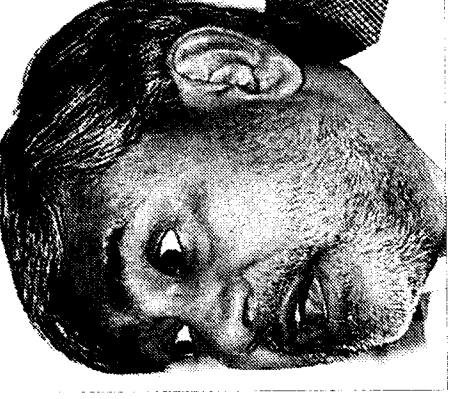
Mr Nitish Kumar

Kumar sticks to his merger plans. Both factions stress on consolidating anti-Laloo forces in Bihar. "Samata Party's main political base is in Bihar and our focus will continue to be on the state. JD-U and Samata had fought parliamentary elections with common symbols but got separated shortly before the Assembly polls. This harmed the NDA. Now we do not see a reason to merge with a party which did not trust us in the past. Moreover, the present Janata Dal does not have any social base and would only encash our popularity. And the party somehow gives the impression of being soft on Mr Laloo Yadav."