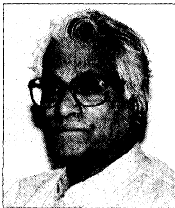
Fernandes: Problems galore