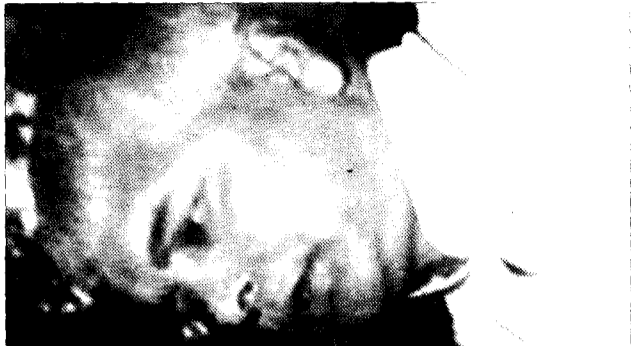
Mr Laloo Prasad Yadav

On the other hand, despite the numerous cases of corruption against him, Mr Laloo Yadav continues to have a strong grip over the Muslim-Yadav vote bank which alone constitutes about 27 per cent of the state's electorate. Mr Yadav's grip over the masses will always come in the way of his political foes.