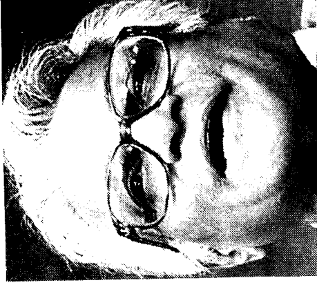
Mr George Fernandes