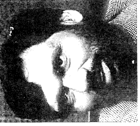
Mr Ram Vilas Paswan