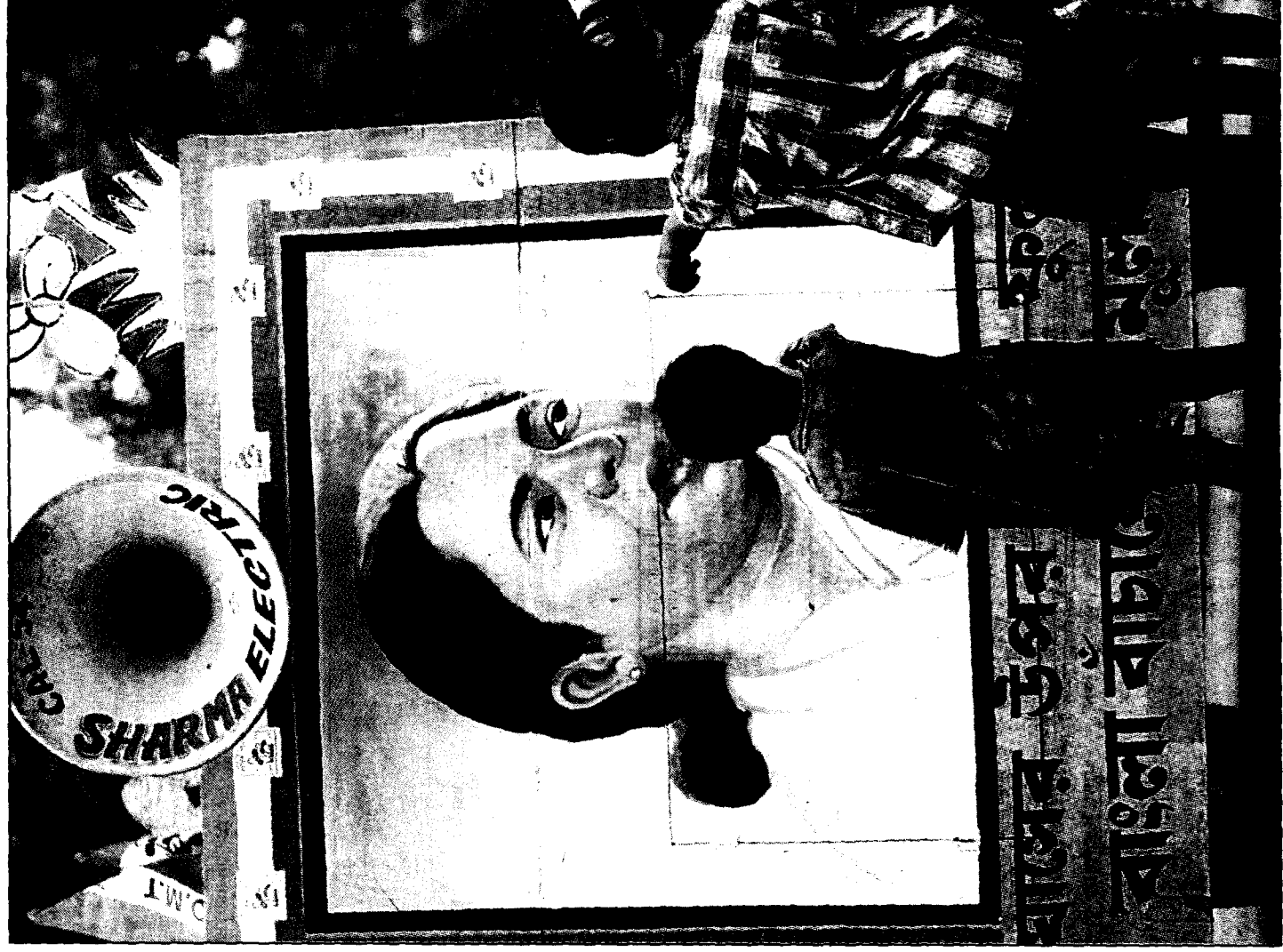
Children look at a poster of Mamata Banerjee on the back of a van in the city on Tuesday.