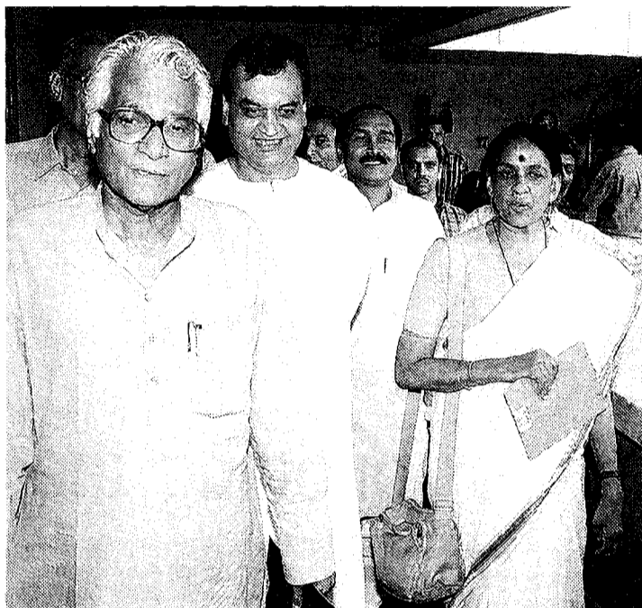
The Samata Party leaders, Mr. George Fernandes, Mr. Digvijay Singh and Ms. Jaya Jaitly, on their way to attend the party's national executive meeting in New Delhi on Monday.

Mr Singh said the Manipur developments were not a betrayal by the BJP but the result of "extreme factionalism." He insisted