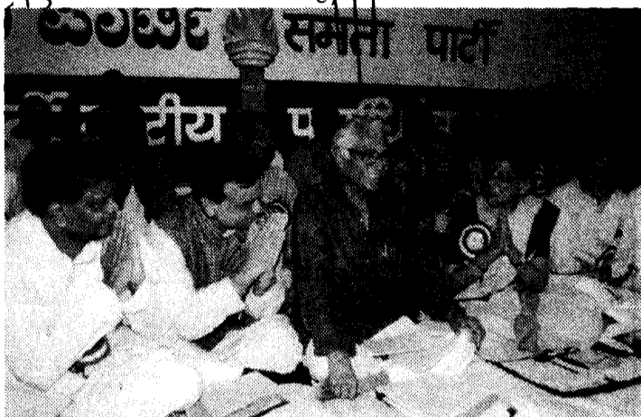
The Samata Party leader, Ms. Jaya Jaitly (second from right), who was reelected party president in Mysore on Monday, seen with the Defence Minister, Mr. George Fernandes (centre), and the Agriculture Minister, Mr. Nitish Kumar (extreme right).