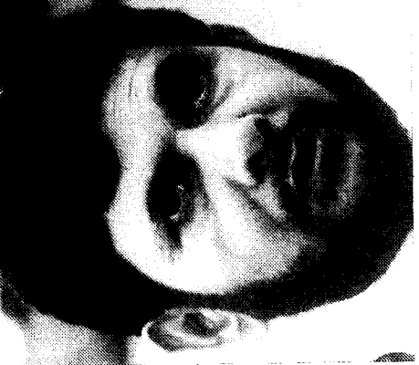
Mr Sharad Yadav