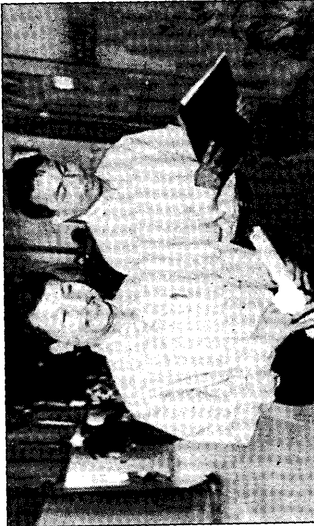
PEACE AROUND THE CORNER? Bodo leaders met in the corridors of North Block.

Tripura, another trouble-spot in North East, is crying to be taken up seriously. That it's run by a Left Government is just one of the reasons for Advani's apparent disinterest. Plus, none of the insurgent groups in the State has shown an interest in talking peace.