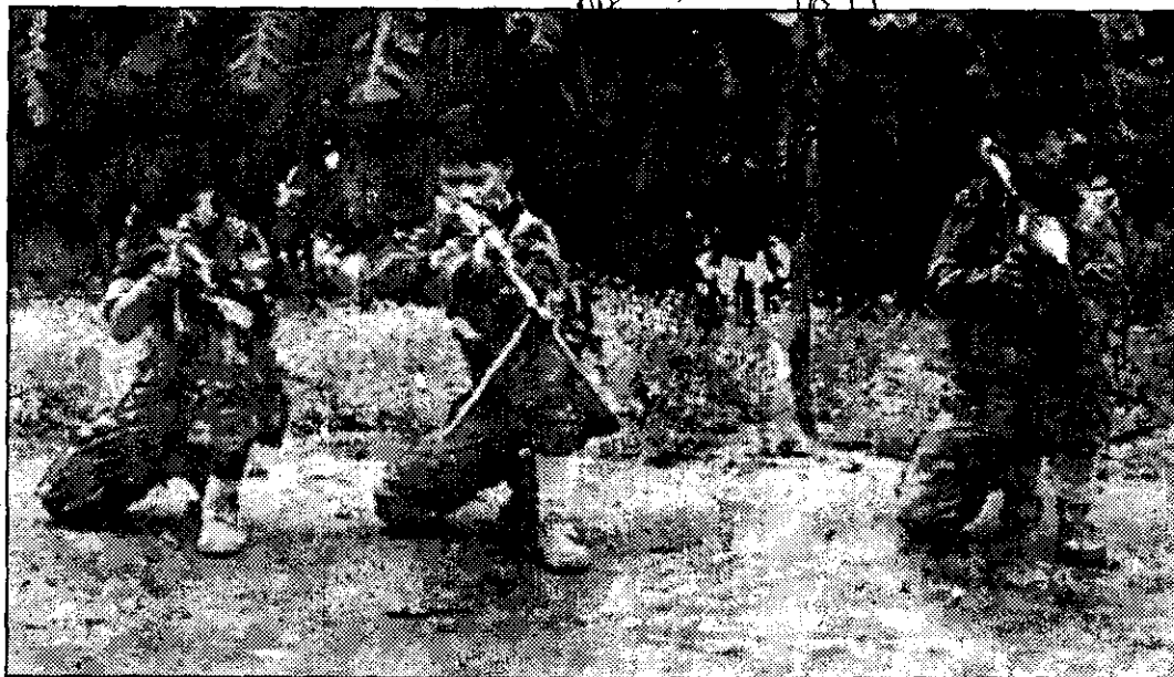
GUN RULE: Militants belonging to the People's Liberation Army in their training camp

bitter rivalries have brought Manipur to the brink of unmitigated disaster. The long-standing feuds between the Kukis and Tangkhul Nagas resulted in killings and counter-killings in the early Nineties, with the active participation of militants from both sides.