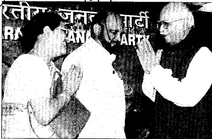
ALL SMILES: Home minister L.K. Advani greets Assam chief minister Prafulla Kumar Mahanta and his wife at the BJP headquarters in New Delhi on Monday.

The AGP has retained the prestigious Dispur constituency in