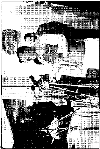
Manipur chief minister Radha Binod Kojiam is being sworn in by Manipur and Mizoram governor Ved Prakash Marwah at the Raj Bhawan on Thursday.

ministers have not been sworn in on Friday, he said they are still to discuss the matter within their Front but when asked about the size of his Cabinet he said "this is the first all-party government in India where people are talking of National government which he was sure will also support him). As far as the size of the ministry is concerned it will neither be a jumbo ministry nor a mini one to accommodate every one and seeing the economic condition of the state they will take the mid-way." He ruled out any differences within the Front on the allocation of the portfolios but at the same time refused to comment whether he will have a deputy chief minister or not.