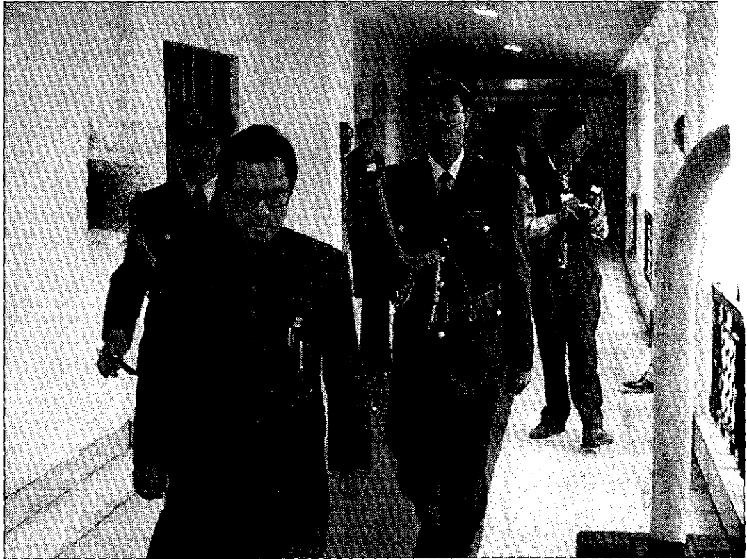
PLANNING AHEAD: Assam Speaker Ganesh Kutum entering the Assembly in Guwahati on Wednesday.

The Congress wants chief minister Prafulla Kumar Mahanta, who also holds the finance portfo-