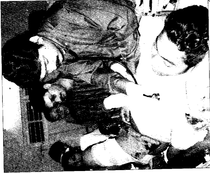
A doctor attends to a victim at a Guwahati hospital on Saturday.

The militants had gunned down two AGP workers at Barama in Nalbari from point-blank range on Friday night.