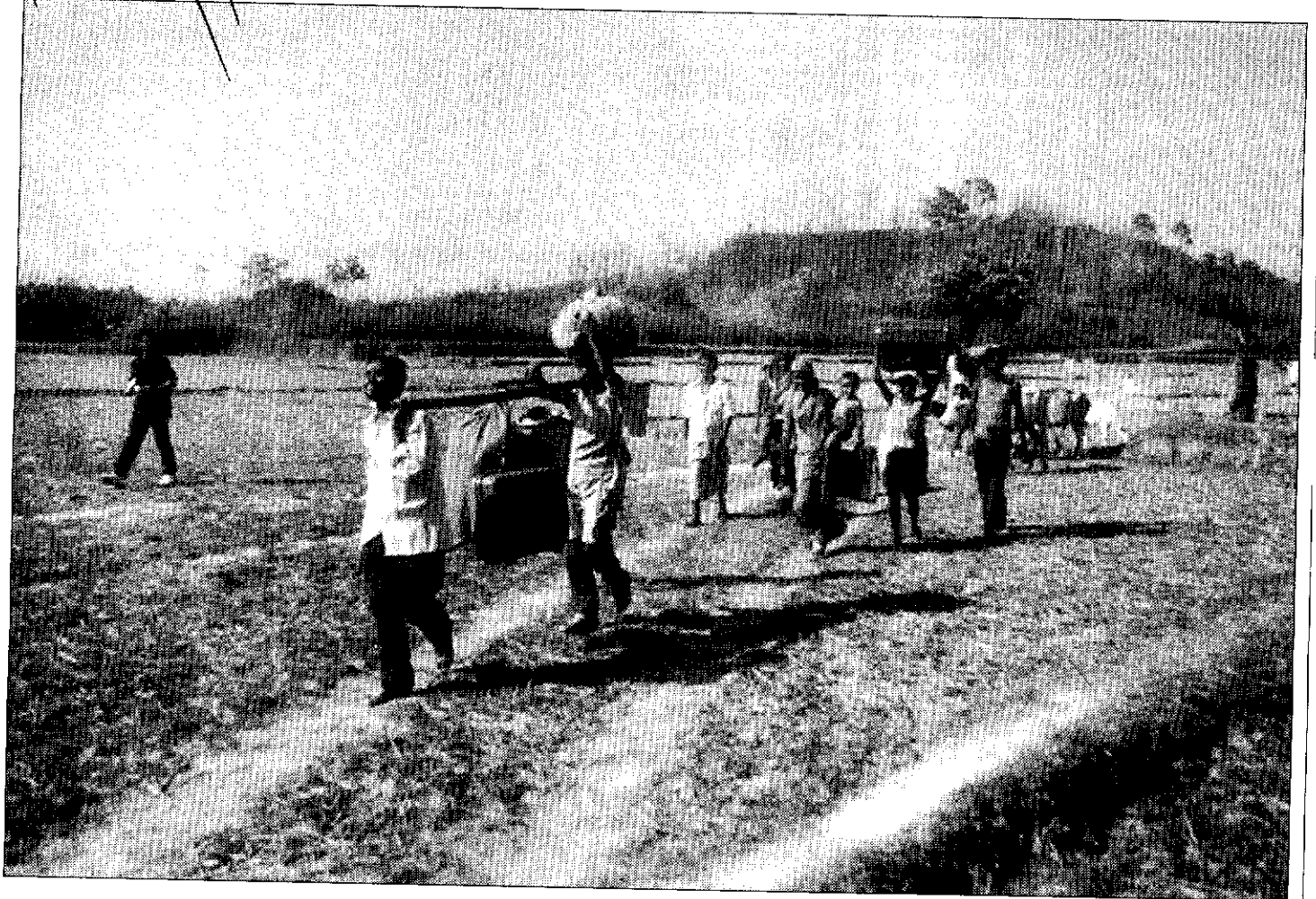
Villagers flee their homes in Mancachar.

Nongrum said the state government would be asked to convey their sentiments to the Centre to tell the Bangladeshi government to "pay for all that they have done