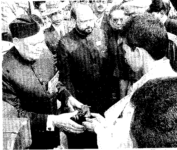
One of the 138 ultras belonging to various militant outfits in Assam surrendering before the Governor, Lt. Gen. (Retd.) S.K. Sinha, and the Chief Minister, Mr. P.K. Mahanta, during the Republic Day celebrations in Guwahati on Friday. (Report on Page 15)

A report from Agartala said The Tripura Governor, Lt. Gen. (retd.) K.M. Seth, appealed to the insurgents to shun violence and join the mainstream to help in building a prosperous State. "The insurgents are misguided youth, who are on the wrong track which will lead them nowhere except to self-destruction" as nothing could be achieved by violence. Mr. Seth said in a Republic Day