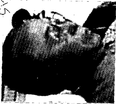
Mr Radhabinod Kojiam

government's change of mind was yesterday's blast which killed three people, including two soldiers. The blast was followed by an heavy exchange of fire between militants and security forces.