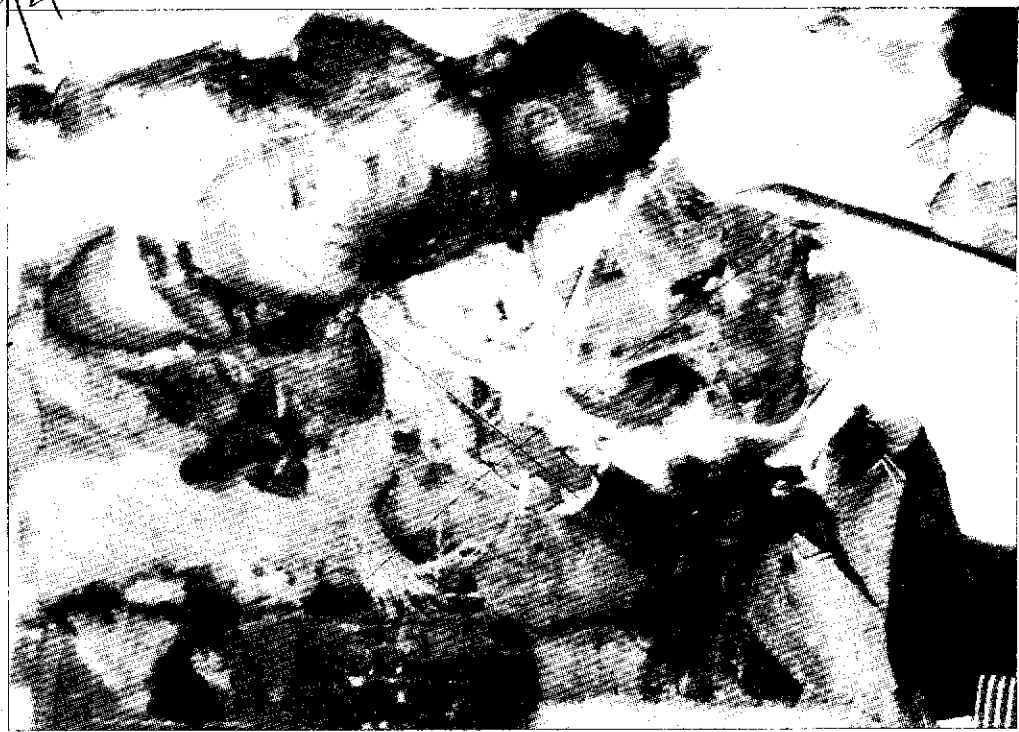
Bodies Of security personnel killed in an ambush in West Tripura on Thursday.