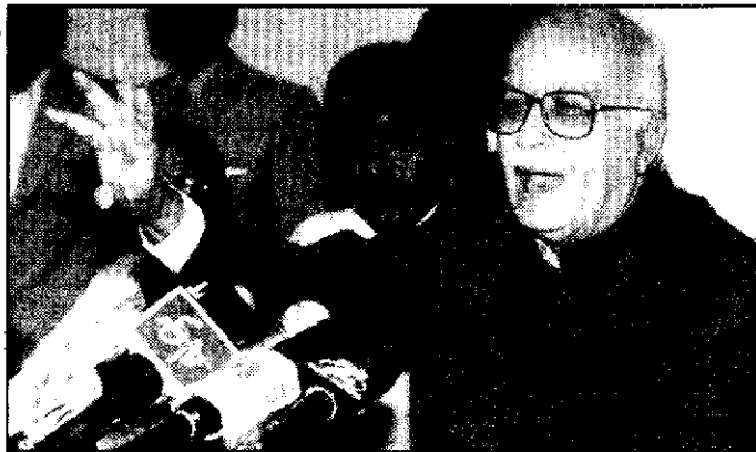
Union Home Minister L K Advani at a press conference in Guwahati on Monday.

The Home Minister further detailed the Government's four-point strategy to combat terrorism in the country. "Firstly, our approach is to deal with terrorism with a firm hand. Secondly, we will endeavour to eradicate economic backwardness and unemployment, which are the key problems leading to terrorist activities in the