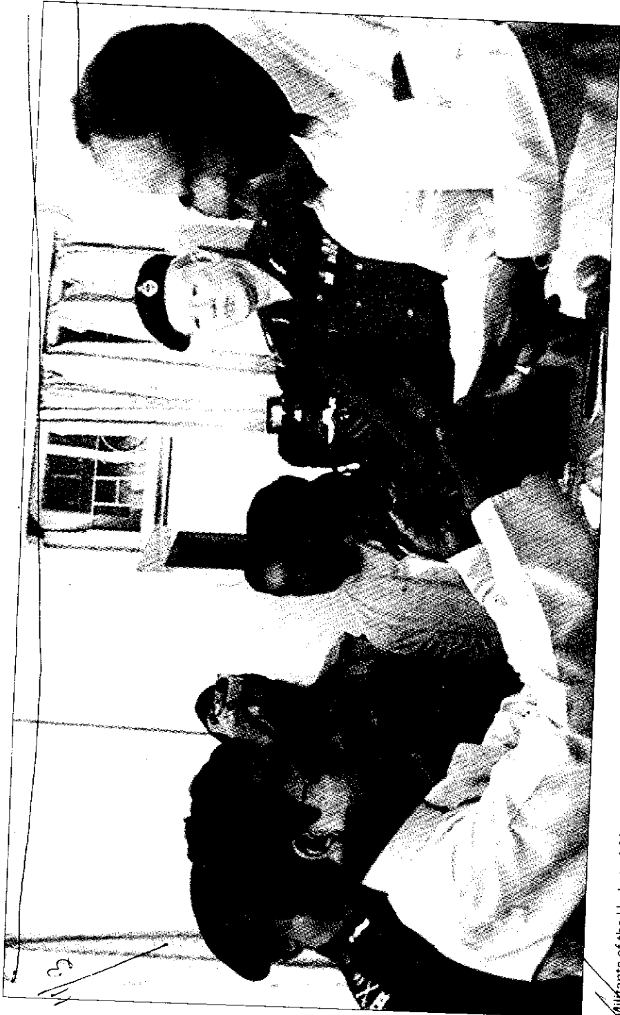
Militants of the Harkat-ul-Mujahideen surrender their arms to Prafulla Kumar Mahanta at Guwahati on Saturday.