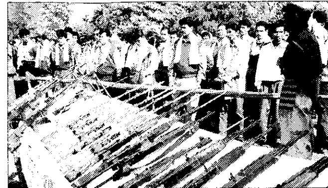
Surrendered ULFA militants with weapons in Guwahati.

So, where does all this money go? A substantial part returns to New Delhi by "unofficial means" and routes, enabling politicians and