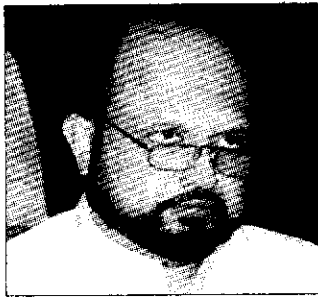
PRAFULLA KUMAR MAHANTA