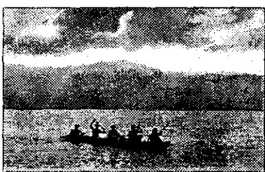
THE LOKTAK LAKE: Terror reigns where once peace ruled

T his situation has continued for years. Everyone is in the know and on the make. Ministers in Manipur and Nagaland are known for their associations with the underground groups, which support candidates in the state Assembly and Parliament elections. At times, a combination of diplomacy, good local contacts and a cool head helps those who do not want to pay (especially members of the All-India services) out of sticky situations.