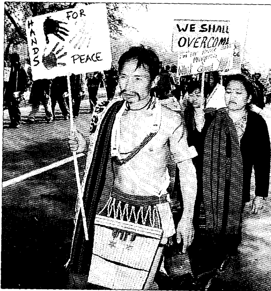
RALLYING AROUND: Members of the Naga Students Federation demonstrating for peace

The traditional Naga administrative organisations, the Ho Hos, the Tribal Councils, have taken the lead in giving some structure to this yearning of the people. The tribal councils of Zunheboto, Yimchungep, Tuensang and Mangkolemba have passed resolutions that are certain to have a lasting impact on Naga