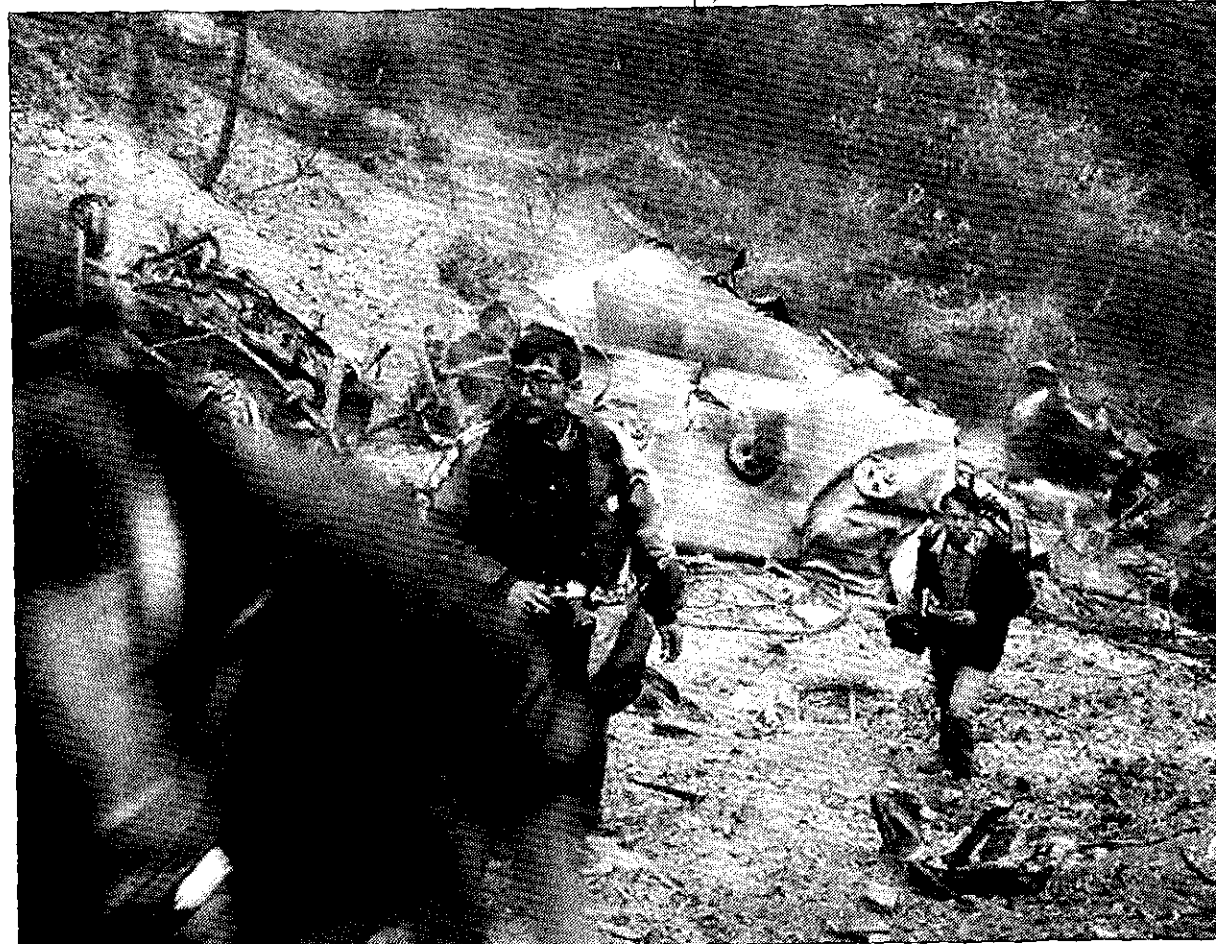
The wreckage of some of the oil tankers burnt by Manipur insurgents between Mao and Karong on NH 39 at regular intervals between December and March.