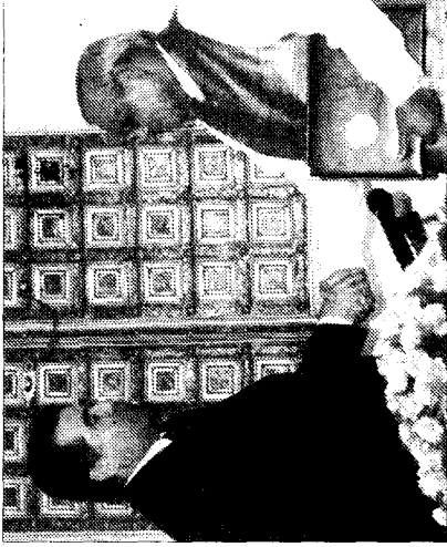
The Tajikistan President, Mr Emomali Sharifovich Rakhmonov, and Mr Atal Behari Vajpayee in New Delhi on Thursday.

The two sides firmed up an agreement for long-term cooperation in trade and industry, besides a memorandum of understanding on technical cooperation and an air services agreement. Mr Rakhmonov, who arrived on a three-day visit yesterday, was accorded a warm welcome this morning by Mr KR Narayanan, Mr Vajpayee, Mr LK Advani and Union ministers at Rashtrapati Bhavan.