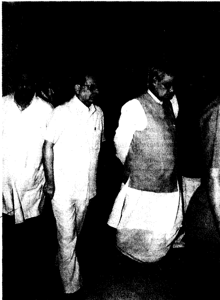
The Prime Minister, Mr. A. B. Vajpayee, and the Health Minister, Mr. C. P. Thakur, coming out of the ICU of the All-India Institute of Medical Sciences, where the Power Minister, Mr. P. R. Kumaramangalam, is battling for life.

According to family sources, Mr. Kumaramangalam was admitted to Apollo Hospital last month following complaints of fever. "Except during the past four months, I have never ever seen him taking any medicine," said a Member of Parliament close to Mr. Kumaramangalam.