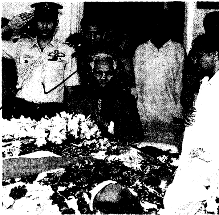
The President, Mr. K.R. Narayanan, paying homage to the Union Power Minister, Mr. P.R. Kumaramangalam, in New Delhi on Wednesday.

from his residence at about 4 p.m. With Mr. Kumaramangalam's body draped in the national tricolor, the procession was led by a high-ranking officer of the armed forces.