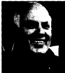
IN A BIND: Farooq