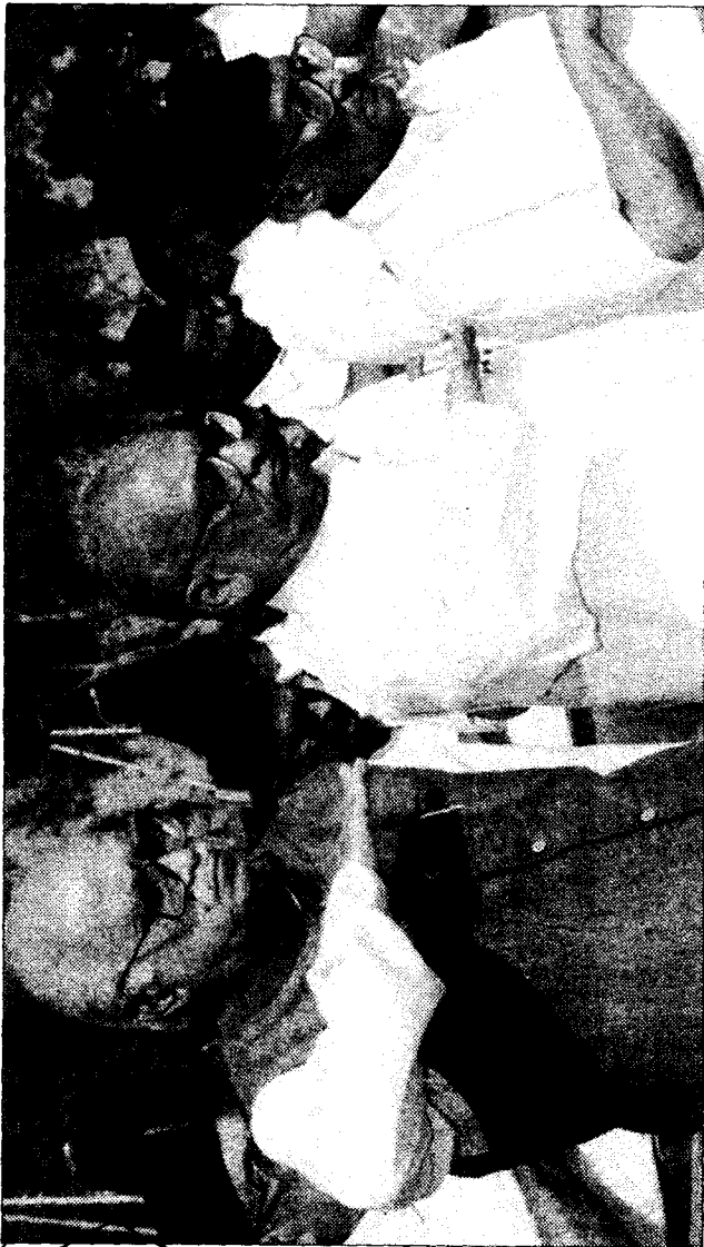
OATH OF ALLEGIANCE: Home minister L.K. Advani and Uttar Pradesh chief minister Ram Prakash Gupta at the RSS Mahasivir near Agra on Sunday.

Further, the RSS chief also criticised what he held was