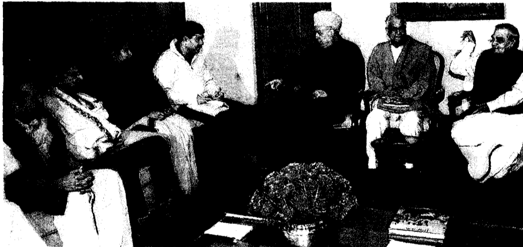
The Prime Minister, Mr. A.B. Vajpayee, with the Defence Minister, Mr. George Fernandes, the Jammu and Kashmir Chief Minister, Dr. Farooq Abdullah, Union Ministers, Mr. Pramod Mahajan, Ms. Mamata Banerjee, Mr. T.R. Baalu and the MDMK leader, Mr. Vaiko, at the NDA meeting at the Prime Minister's Office in New Delhi on Sunday.

Speaker's meet crucial: Page 13 Text of resolution: Page 15