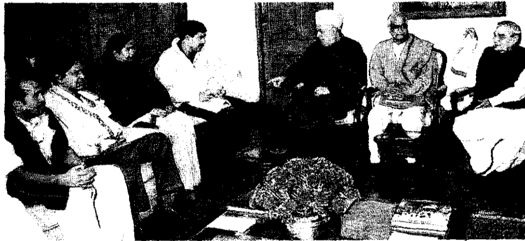
The Prime Minister, Mr. A.B. Vajpayee, with the Defence Minister, Mr. George Fernandes, the Jammu and Kashmir Chief Minister, Dr. Farooq Abdullah, Union Ministers, Mr. Pramod Mahajan, Ms. Mamata Banerjee, Mr. T.R. Baalu and the MDMK leader, Mr. Vaiko, at the NDA meeting at the Prime Minister's Office in New Delhi on Sunday.

Speaker's meet crucial: Page 13 Text of resolution: Page 15