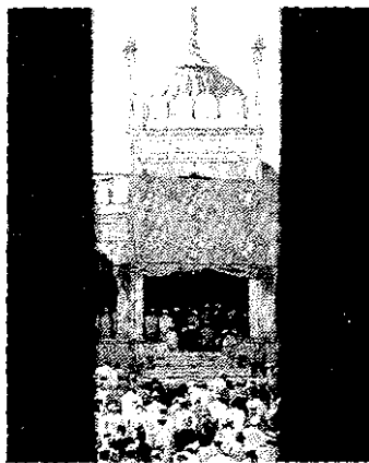
Muslims pray in Bhopal on the last Friday of the month of Ramzan.

Addressing Muslims at the Jama Masjid, the Maulana said: "If so called secular parties want to strengthen secularism, it's the time for their test". The government should allow an independent probe by international organisations into the