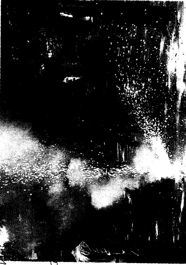
Fans celebrating the release of the actor, Mr. Rajkumar, in front of his house in Bangalore on Wednesday.

Many persons had helped the Government in its efforts at resolving the crisis and some had worked behind the scenes. The negotiators came forward to help on humanitarian grounds. A number of them walked a long distance into thick jungles. All for the love and affection they had for