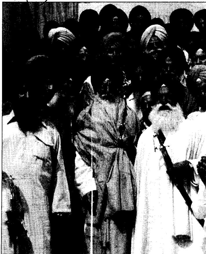
The new Jathedar, Giani Joginder Singh Vidyanti (centre) comes out of Akal Takht after participating in religious ceremonies at the Golden Temple on Wednesday.

SNS adds: The Akali Dal president, Mr Parkash Singh Badal, today ruled out the immediate change in the SGPC leadership. "There is no ques-