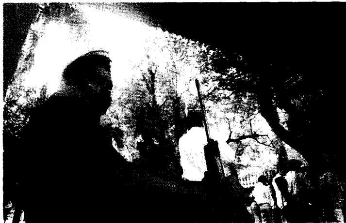
A policeman maintains vigil outside the residence of the Shiv Sena leader, Mr. Bal Thackeray, in Mumbai on Wednesday.

He warned the Sena members that if the party cadre took the law into their hands, the Government and the police would have no option but to do their jobs. He advised the Leader of the Opposition, Mr. Narayan Rane, to