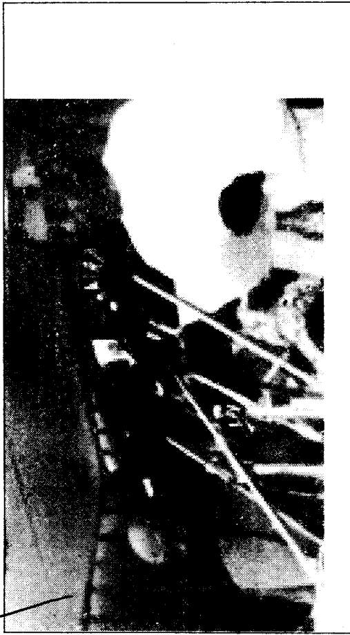
Mr Navin Patnaik takes oath as the new chief minister of Orissa at Raj Bhavan in Bhubaneswar on Sunday.

The coalition partners are sharing the ministerial berths on the basis of 16:9 ratio. Of the 14 Cabinet ministers, nine