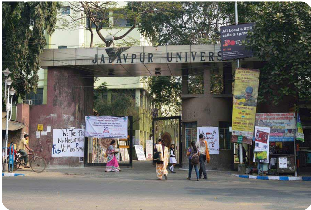
Jadavpur University File image