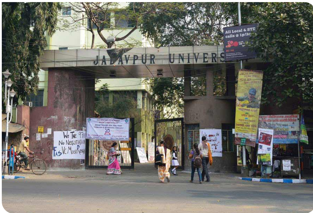
Jadavpur University File image