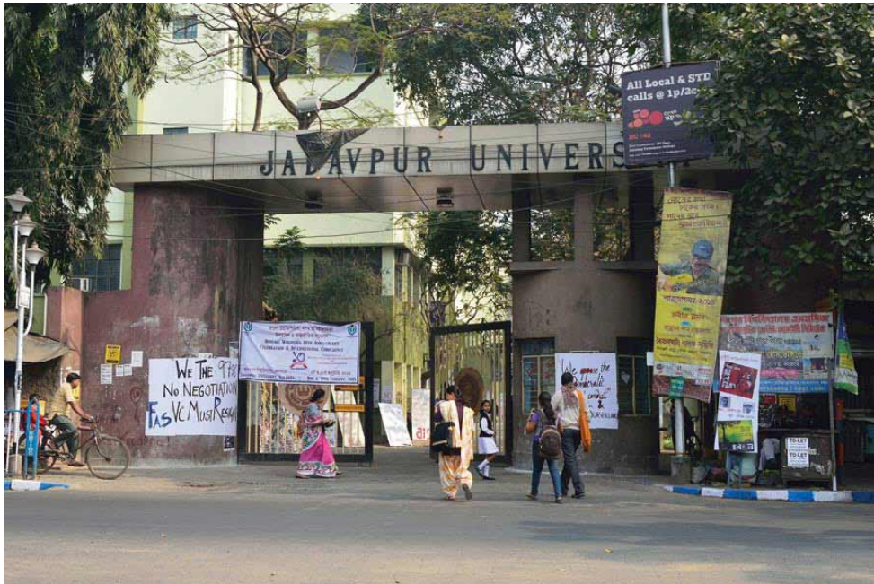
Jadavpur University File image

Jadavpur University has barred a postgraduate student in humanities from entering the campus after his name cropped up in a complaint of alleged harassment that led to the death of an undergraduate student.