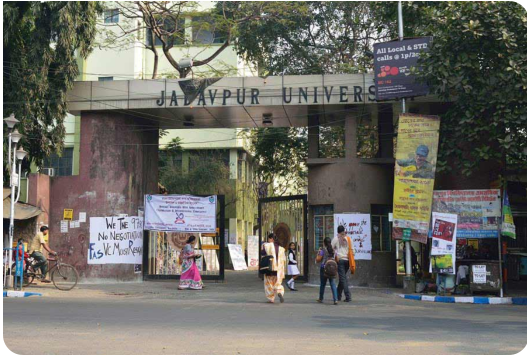
Jadavpur University File image