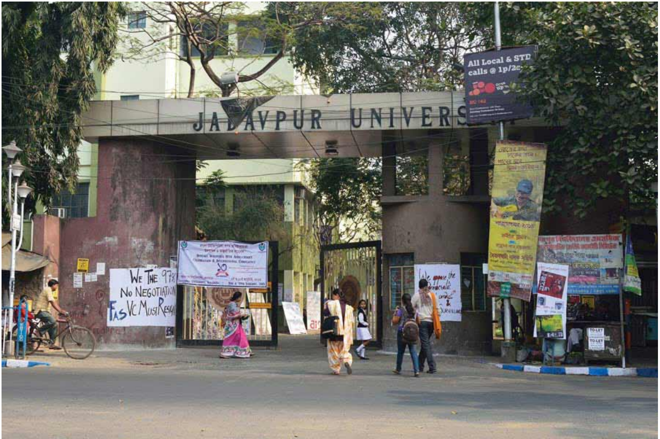
Jadavpur University File