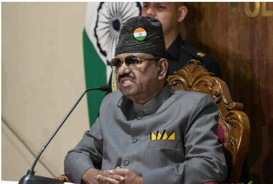
C.V. Ananda Bose

SUBHANKAR CHOWDHURY | PUBLISHED 08.01.24, 06:21 AM