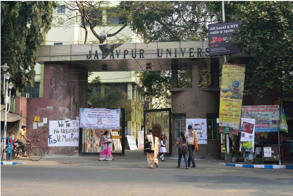
Jadavpur University File picture

SUBHANKAR CHOWDHURY | PUBLISHED 03.01.24, 06:03 AM