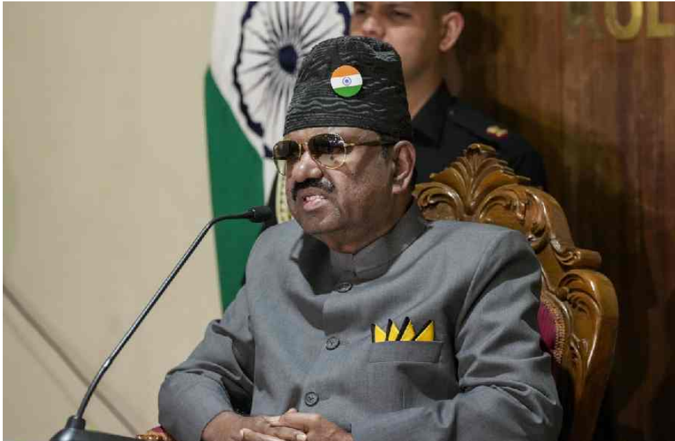
C V Ananda Bose File image

SUBHANKAR CHOWDHURY | PUBLISHED 26.12.23, 07:22 AM