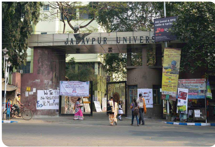
Jadavpur University File image