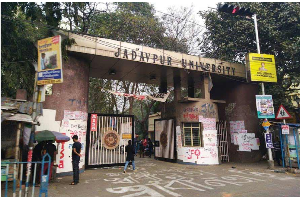
Jadavpur University. File picture

SUBHANKAR CHOWDHURY | PUBLISHED 25.12.23, 06:21 AM