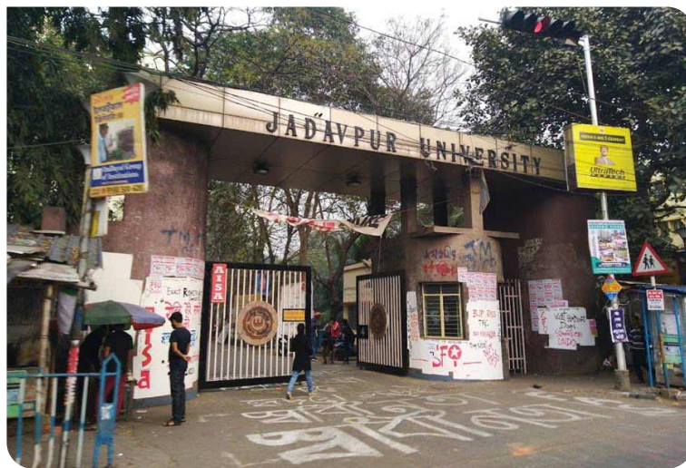
Jadavpur University File image